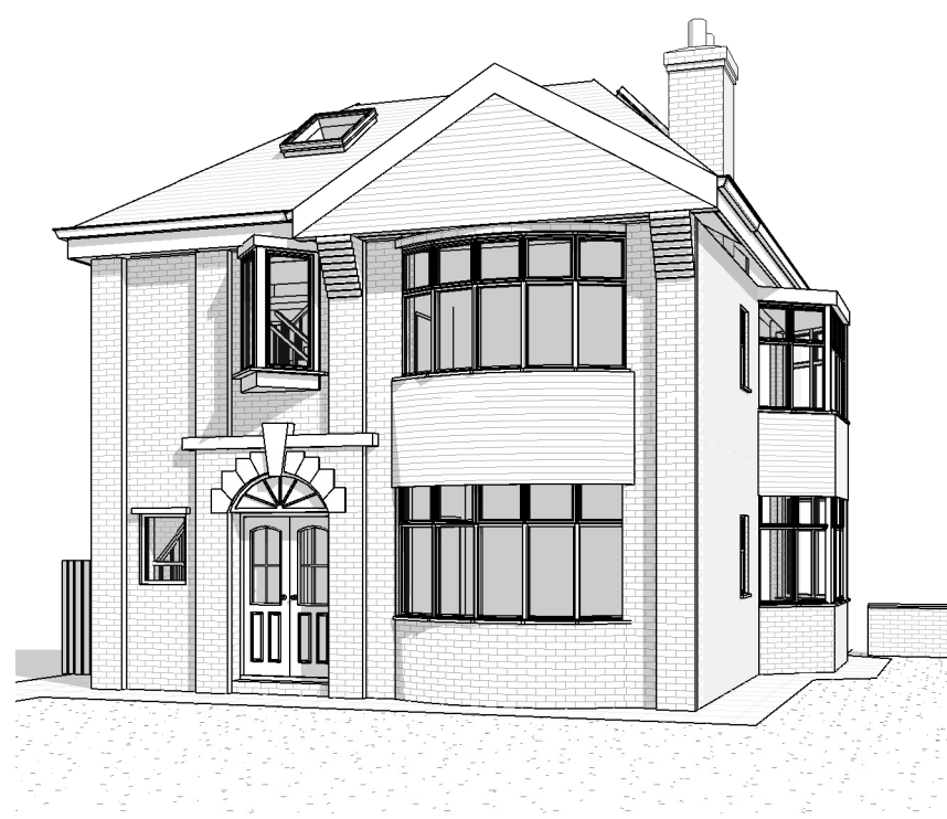
2 Proposed Front View