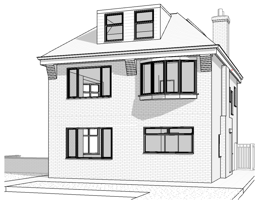
3 Proposed Rear View