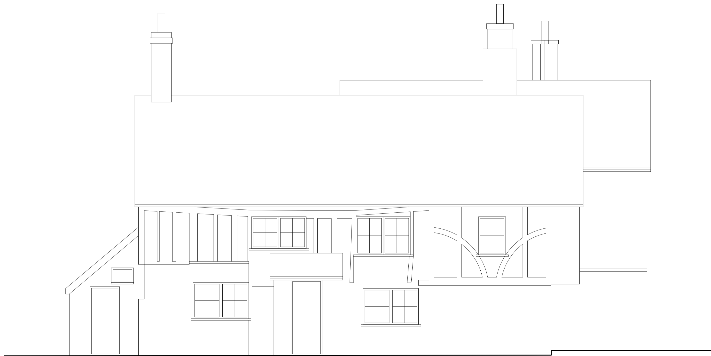
1 Existing South Elevation 1:100 @A3