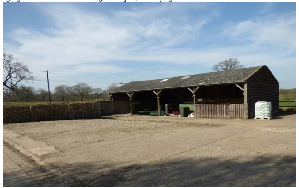
Northern Store - Currently the furthest outlier of the building group: proposed for removal