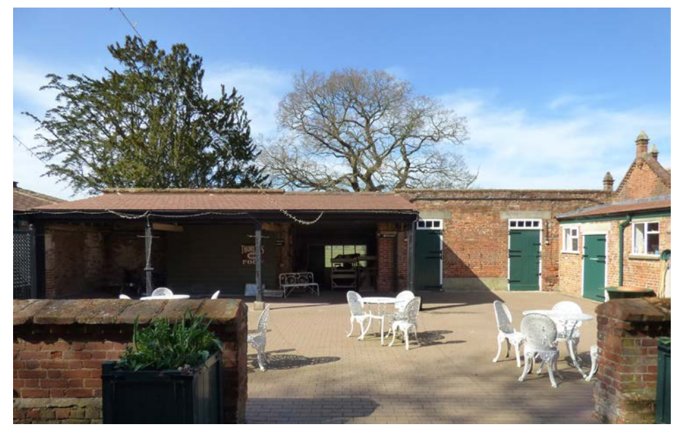
The Stable Yard - view from the Stables