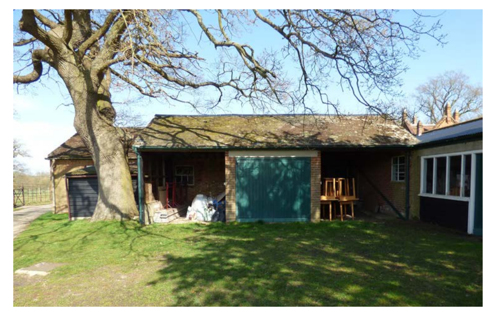
West elevation of garage/store (potential shop if lean-to roof is removed?)