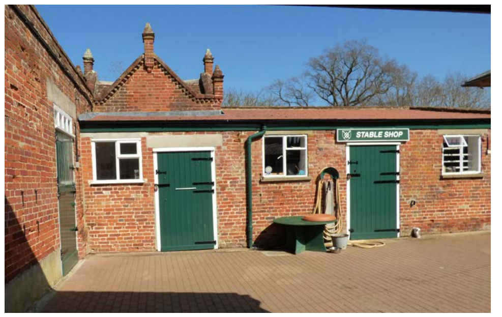
North corner of Stable Yard: is this the enveloped pavilion apparent on Isaac Ware's map of 1803?