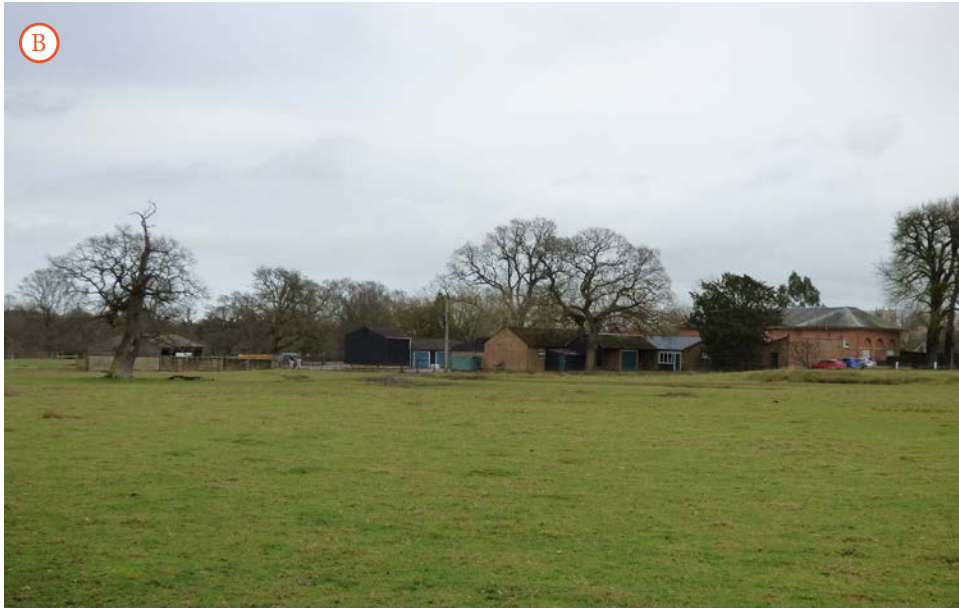
'Telephoto zoom' of above