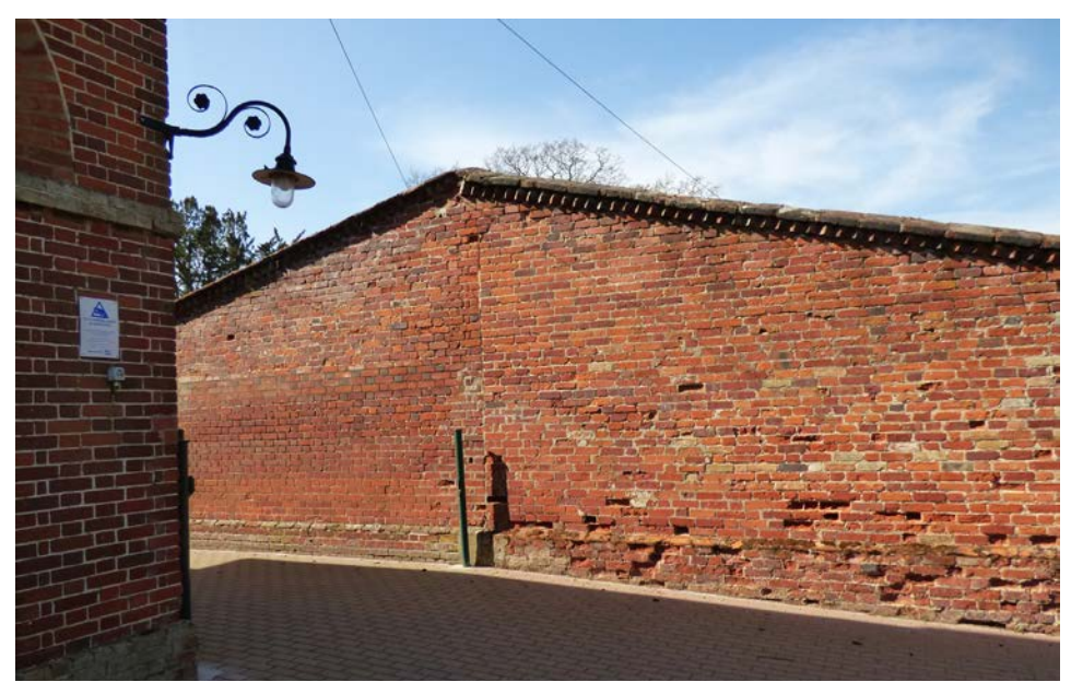
Southern end of North-East Stable range: Note multiple phases of brickwork apparent