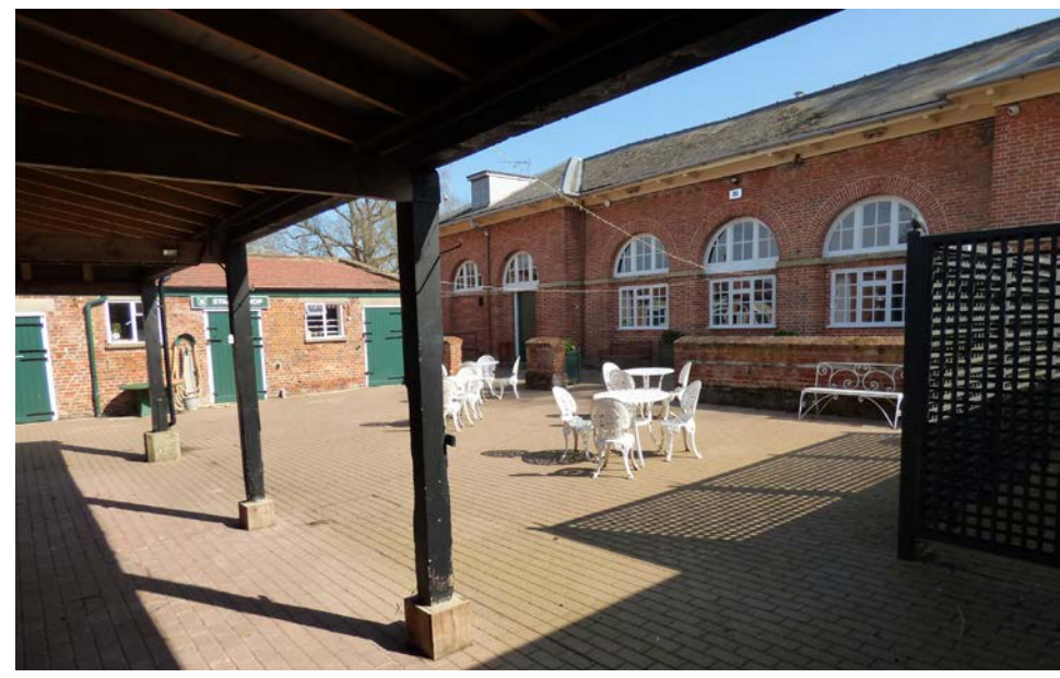
Stable Yard - view from North-West corner