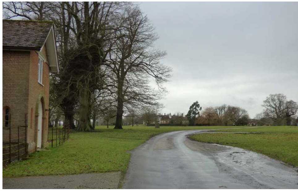
View from Back Lodge in winter