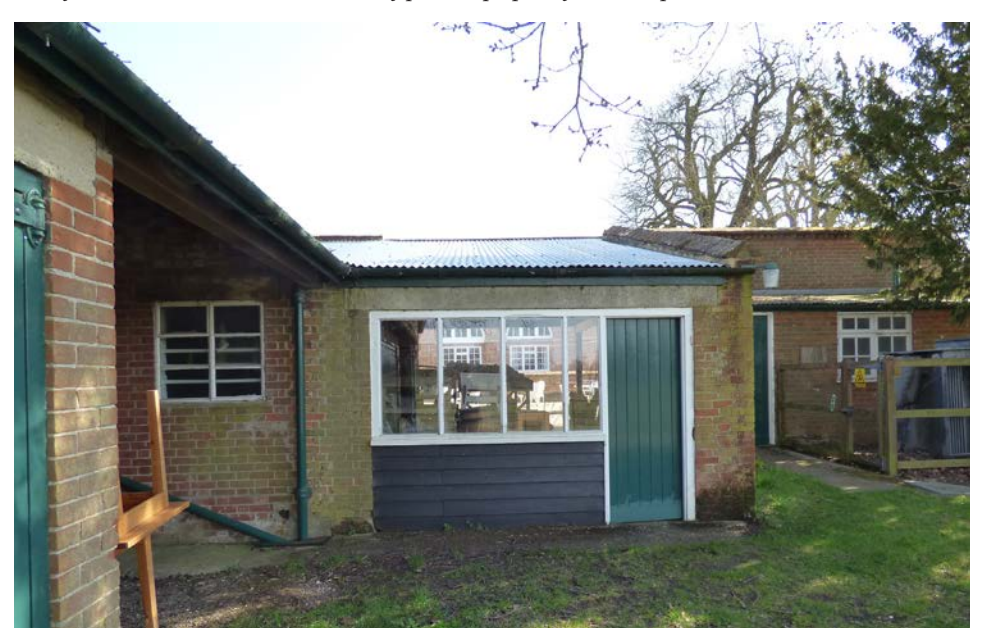
Potential infill to be removed, to allow a more direct connection between stable yard, park and potential shop. Note existing substation and gents WCs to right