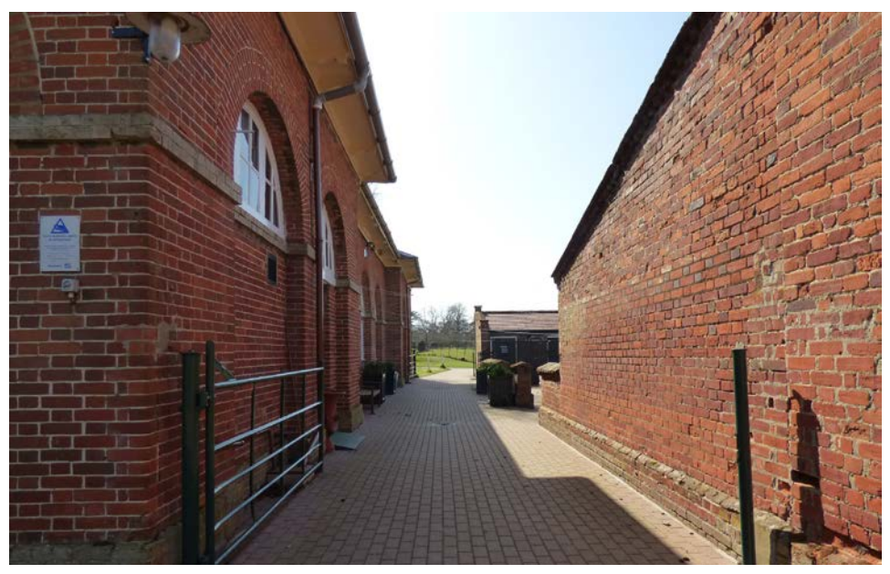
View along North-East elevation of stables, through the yard