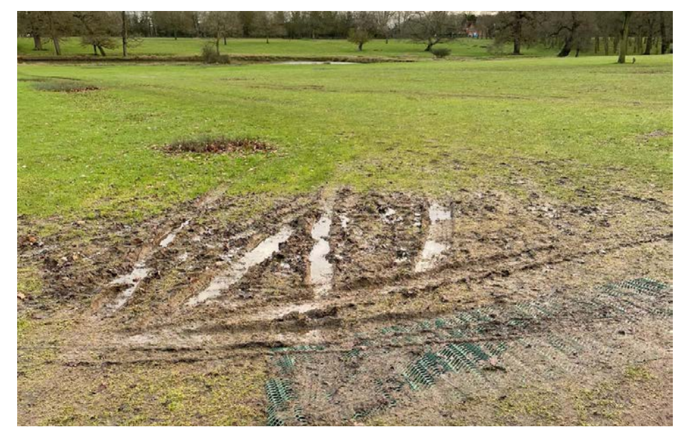
View towards the Front Lodge: the scars of winter parking clearly visible