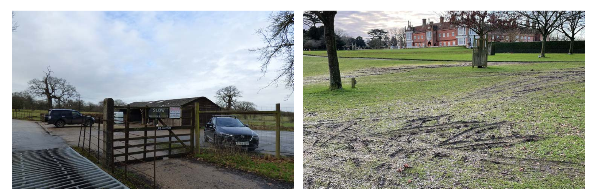
The current visitor entrance