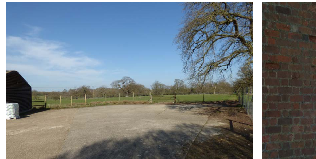
View from the Northern Yard to the area of paddock proposed for the car park