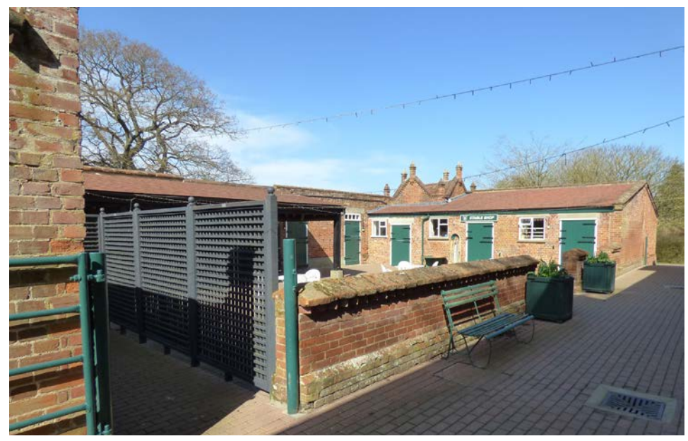
The Stable Yard - view from South-west corner