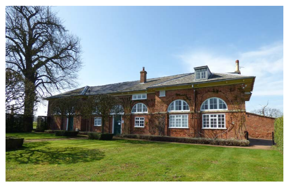
South-east side of Stables: an underused area of garden? The estate office is currently behind the right hand windows