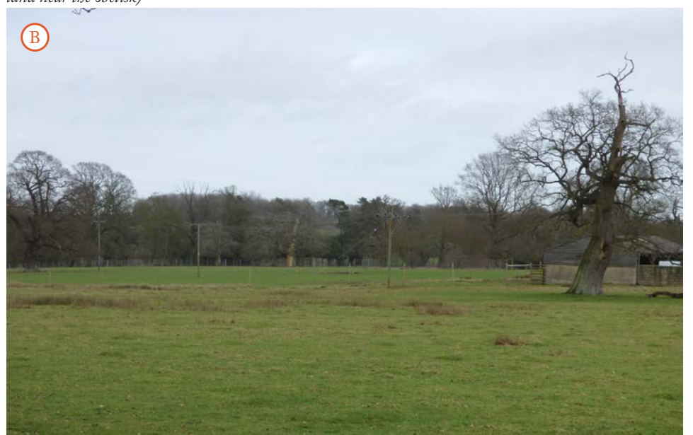
Telephoto zoom of above – significant planting is proposed along the western boundary of the new car park and to screen the proposed gardeners' yard.