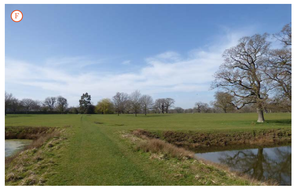
View from between fish ponds towards potential car park site. Currently car parking is in the foreground area of park