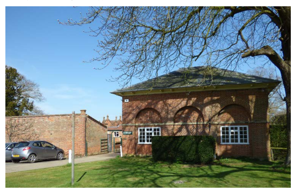
Stables - South-west elevation (viewed from the Hall)