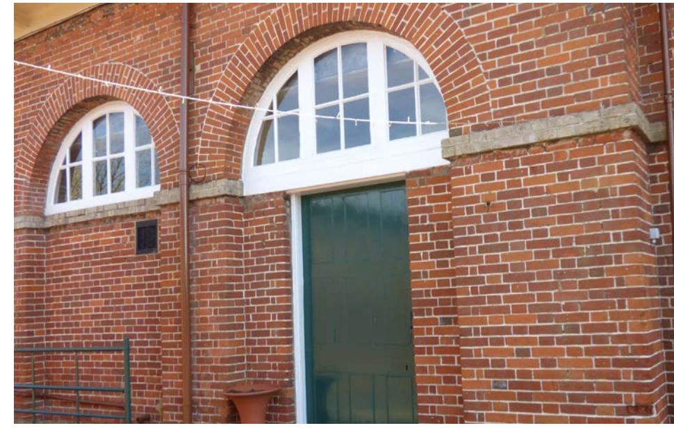
The Stables: unaltered lunette window and door