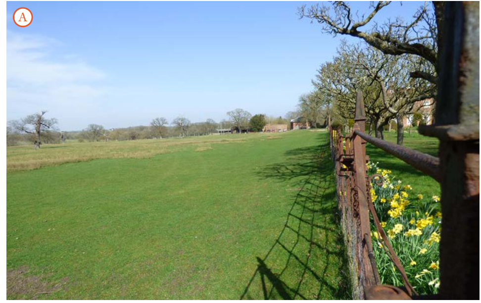
View towards the Stables and proposed car park location from the most westerly point of the gardens (taken at the gate through the orchard)