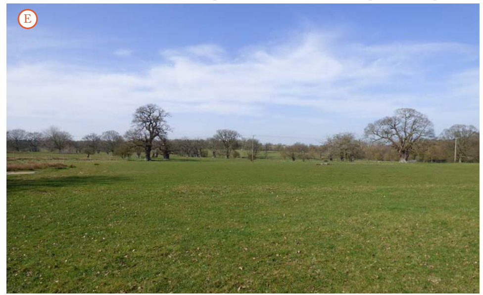
View of proposed car park site, from intended entry point to the South, looking north. A public footpath runs along the western edge, heading north across 'Constable's bridge' which is just visible in the middle distance