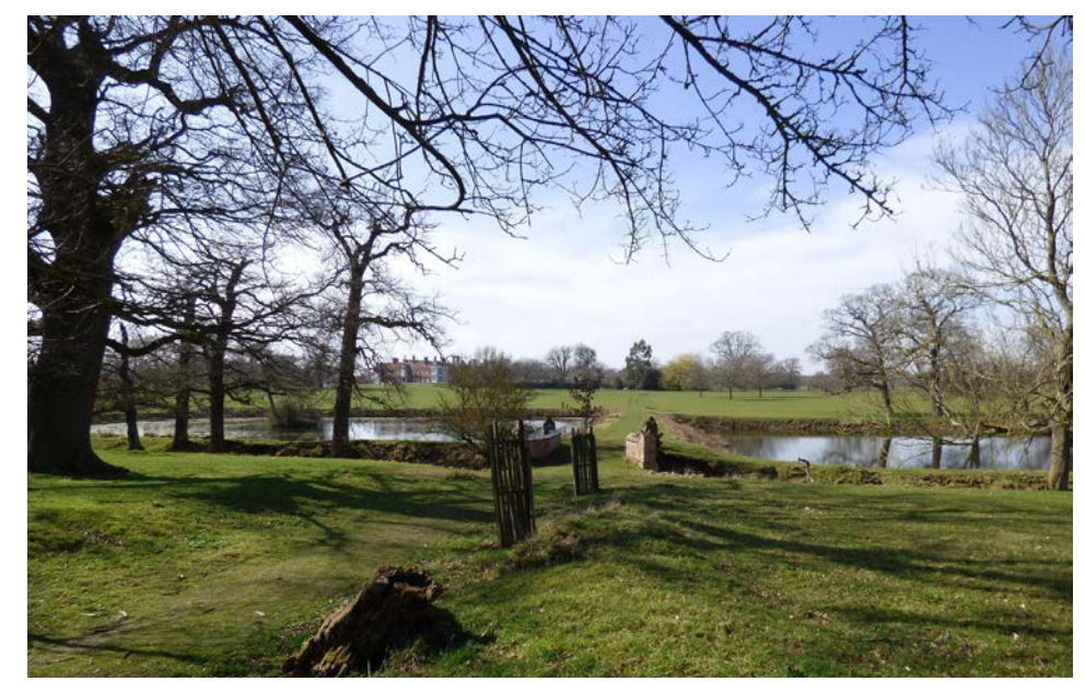
The Hall and park viewed from the footpath from the church