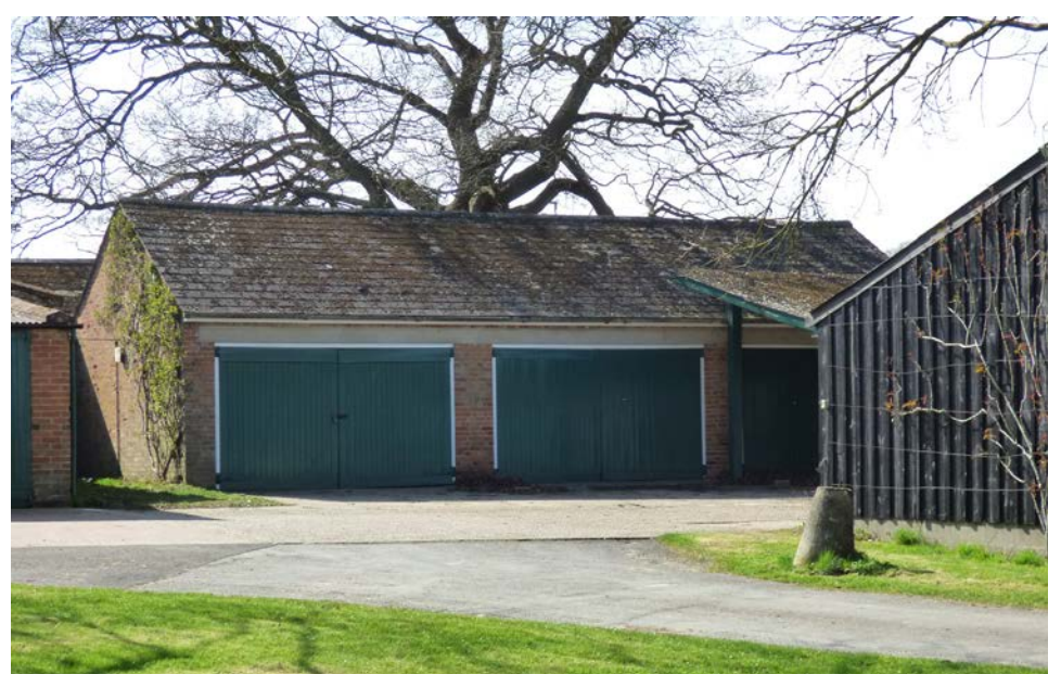
Garage/Store - a building which could potentially be repurposed as the shop or visitor reception