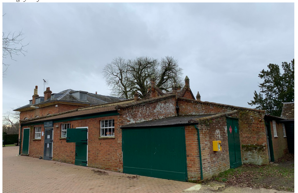
Current shop and adjacent store