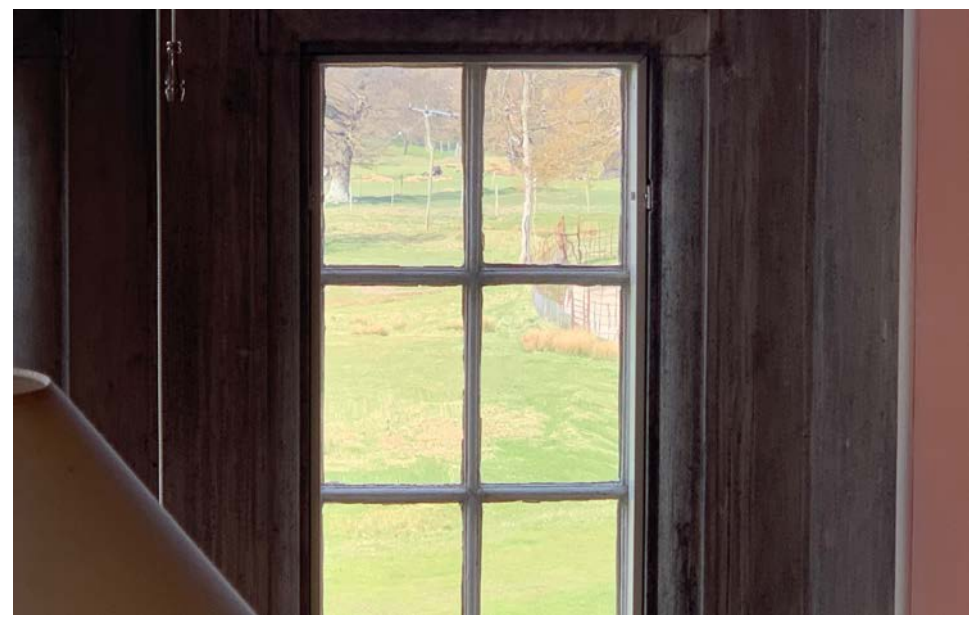
View from the first floor room bedroom window at the west corner of the house