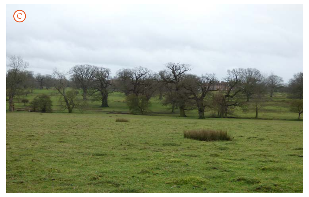
Winter view from park looking South-East. Constable's bridge is to the far left