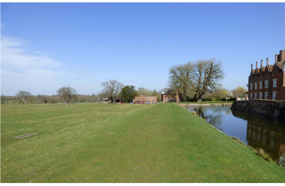
View looking North-West past the kitchen of the Hall, towards the Stable Yard. The most northerly outbuilding can be seen in the distance. The electricity poles mark the location of the proposed car park.