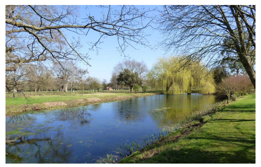
The pond/moat to the East of the Stables