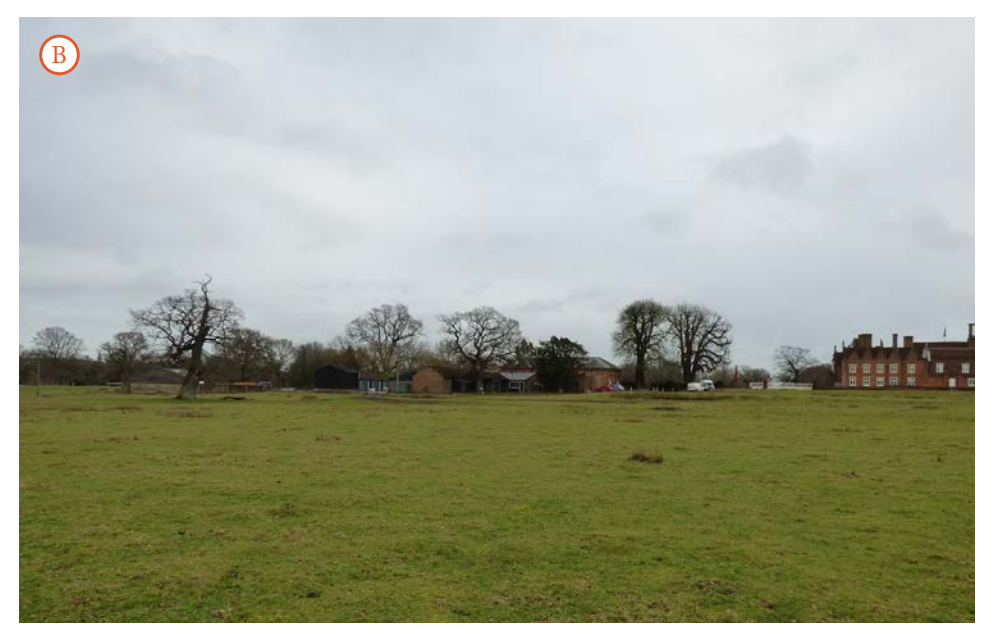
The Stable block and outbuilding group viewed from the North West (taken at the edge of the open woodland near the obelisk)