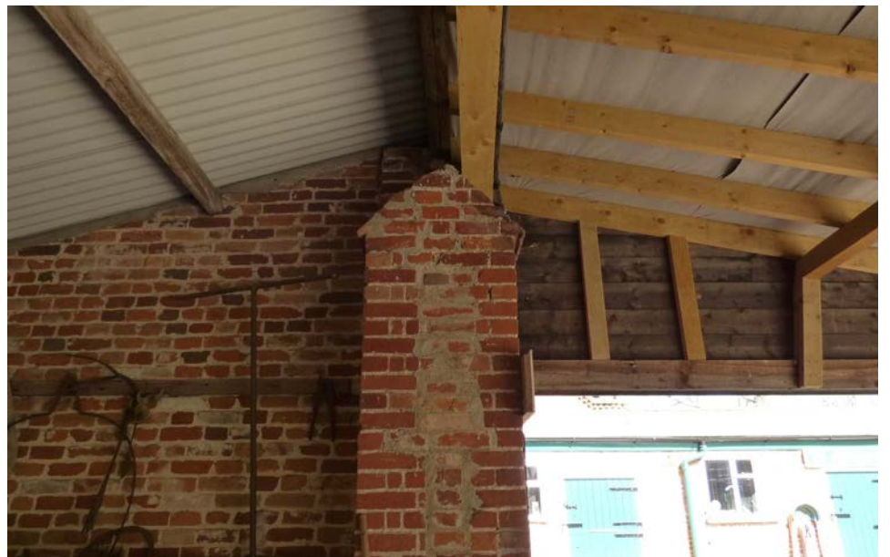
North-west side of Stable Yard: remnant of former yard wall?