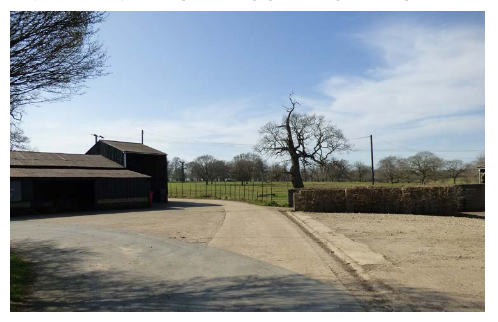
View from the cattle grid at the yard entrance - the current visitor entrance