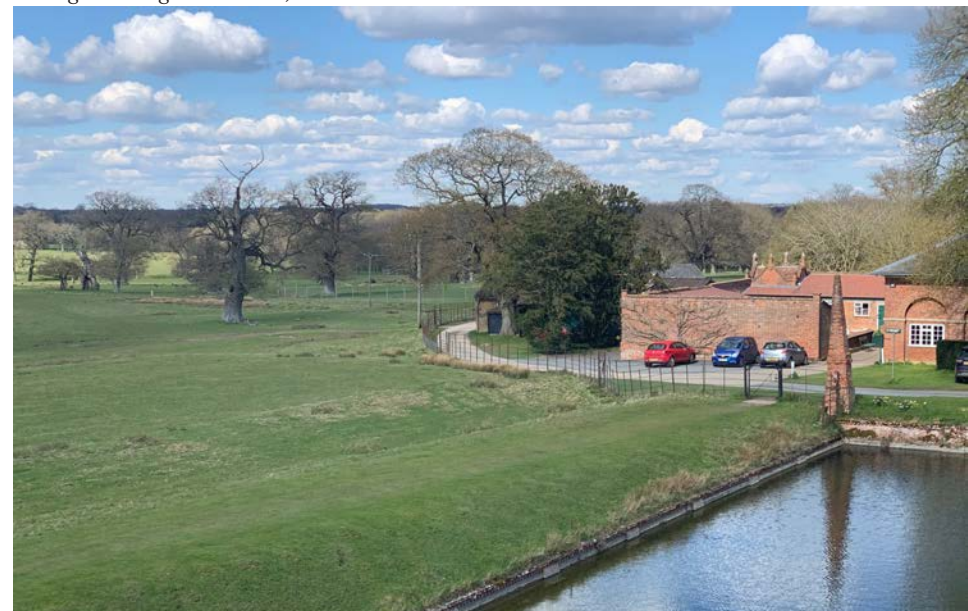
Bedroom window view (as left-hand side)