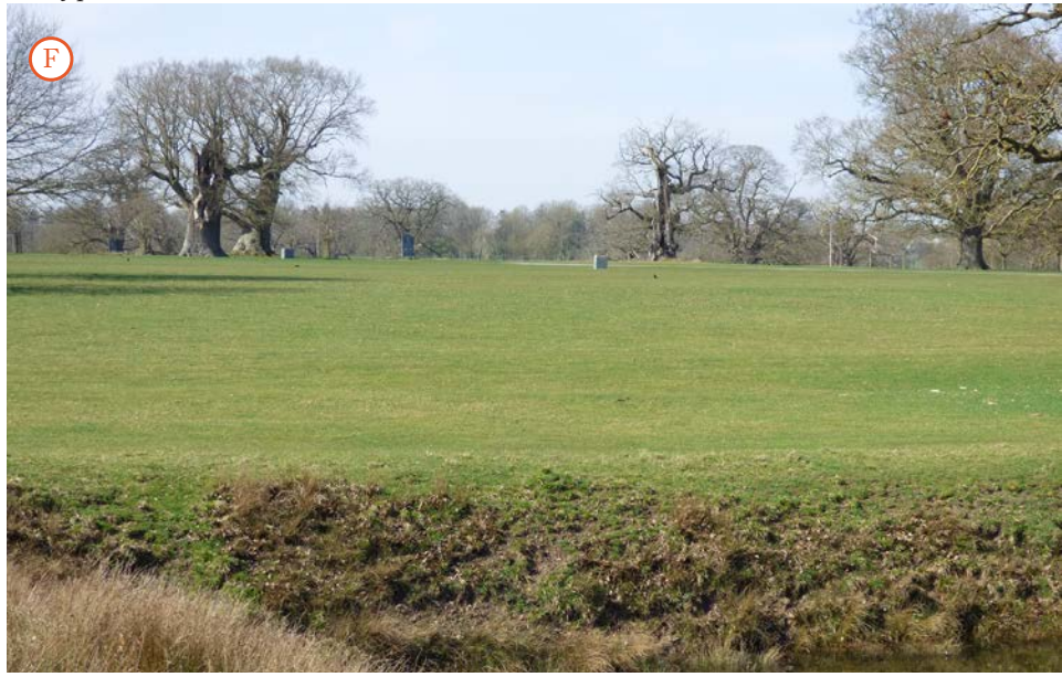
Telephoto zoom of above view: fencing to the right hand side of the photograph marks the location of the most easterly extent - where coach parking could be accommodated