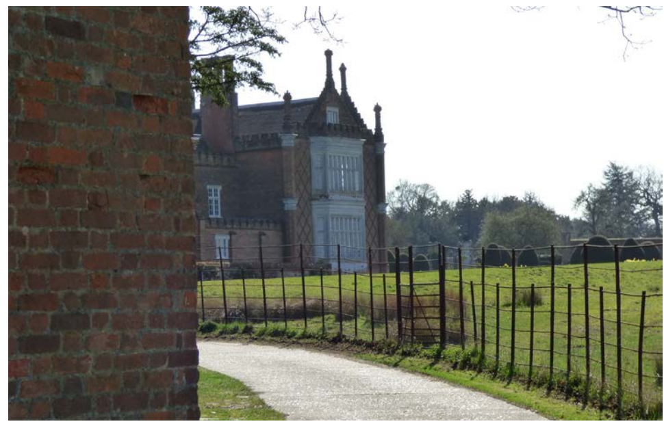
View of the Hall from the back drive, rounding the potential shop (current garage store)