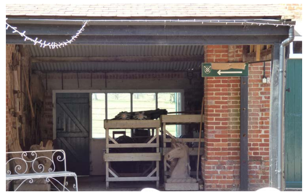
North side of Stable Yard: potential inserted roof to be removed