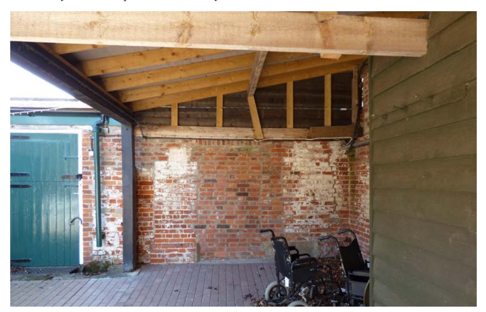
Stable Yard: view to North-West corner showing inserted roof potentially to be removed. Note also the blocked doorway and possible remnants of the North East 'pavilion' apparent on the Isaac Ware map of 1803