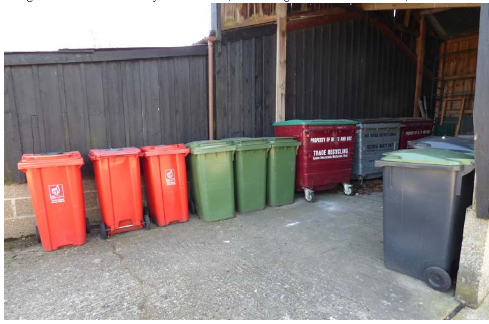
Bin storage - could be more out of sight?