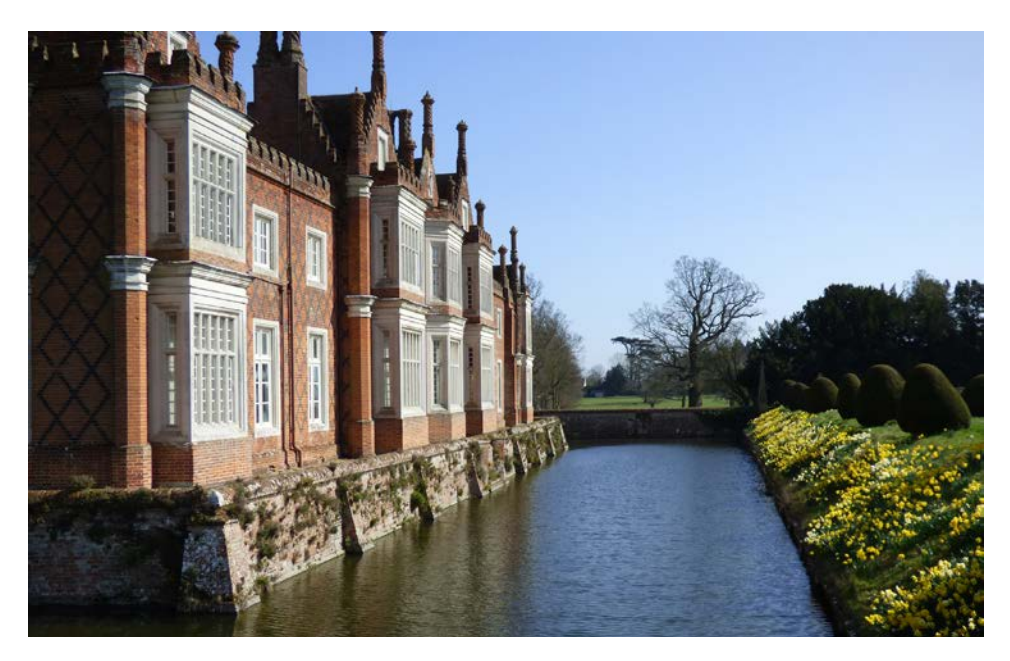
View of the South-West elevation of the Hall, looking onto the main gardens