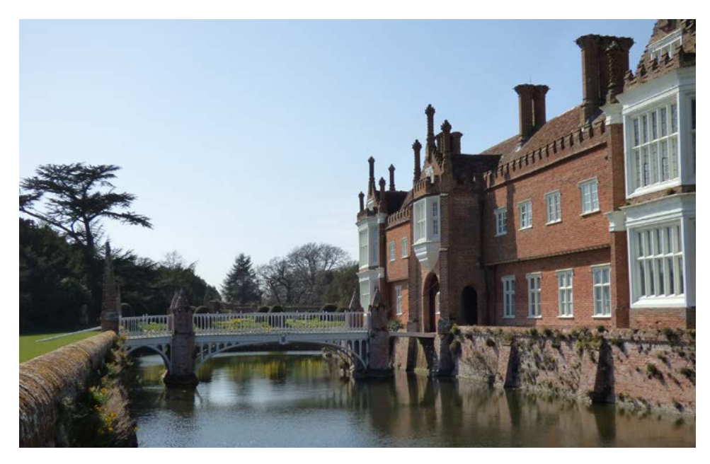
Helmingham Hall: Oblique view of front (South-East) Elevation