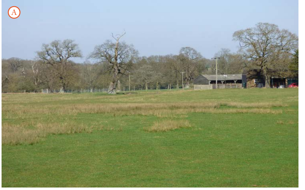
'Zoomed in' photograph of area of proposed car park (below the electricity lines). See right-hand side for full context