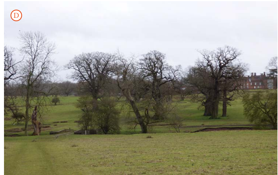
Winter view from footpath to North: Hall to right and potential car park location in the middle distance. 'Constable's bridge' in the foreground. Additional planting will lessen the impact of parked vehicles in this view. Note the lone thorn on the boundary – more of this coupled with standards would obscure parked cars in paddock