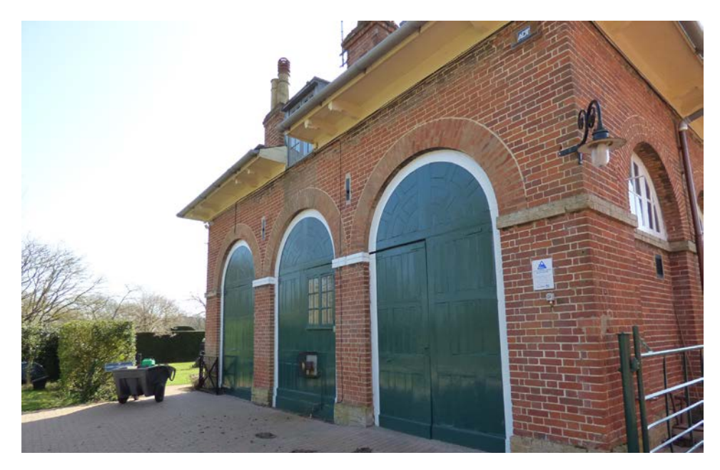
North-East elevation of Stables