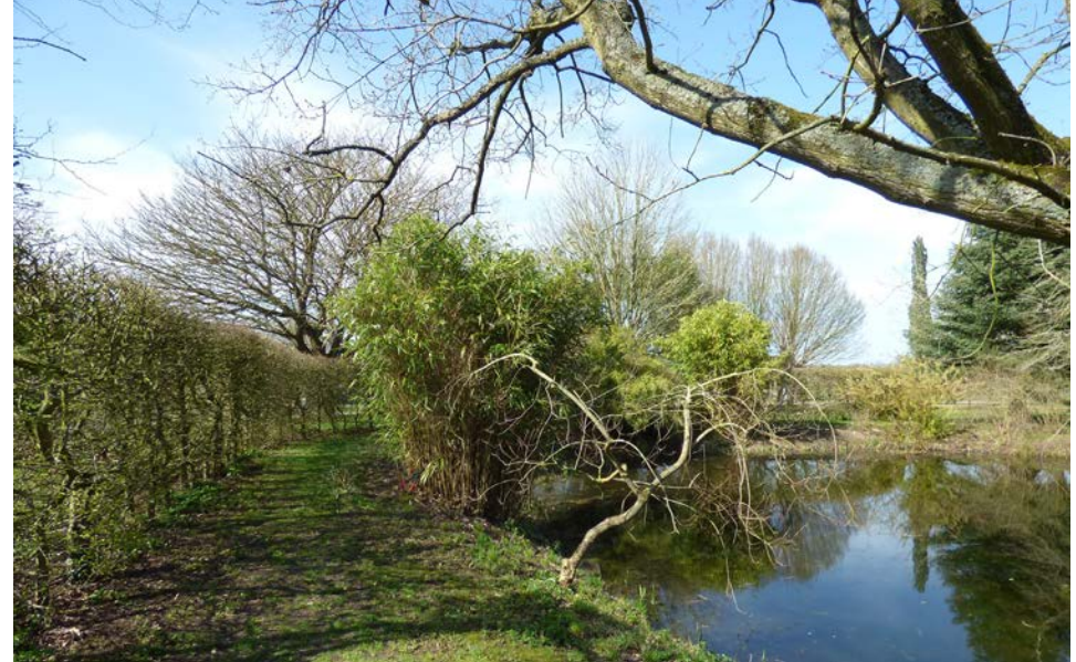
View North-West along the pond