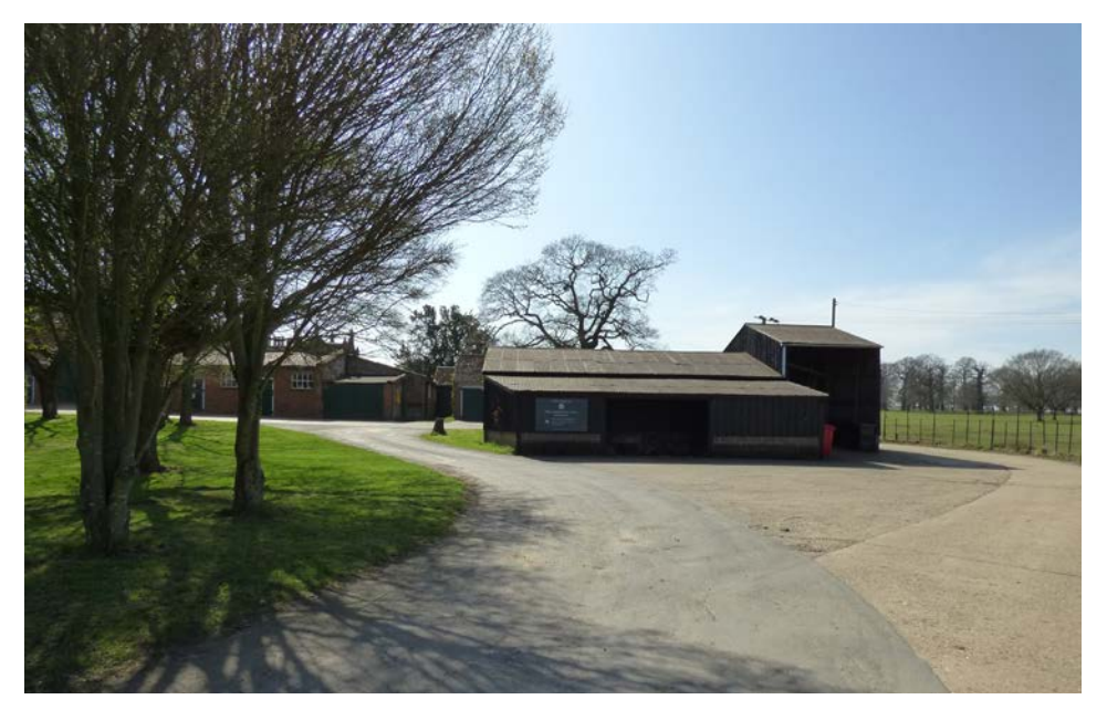
Current visitor entrance - Looking South-west towards wood store & bins. The entrance relies heavily on signage. The current visitor ticketing and shop is just out of sight behind trees