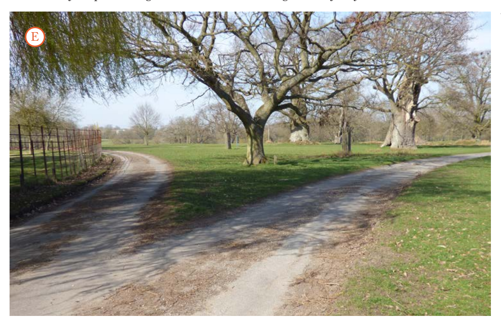
View from the triangular green where branches of back drive meet, looking towards the car park