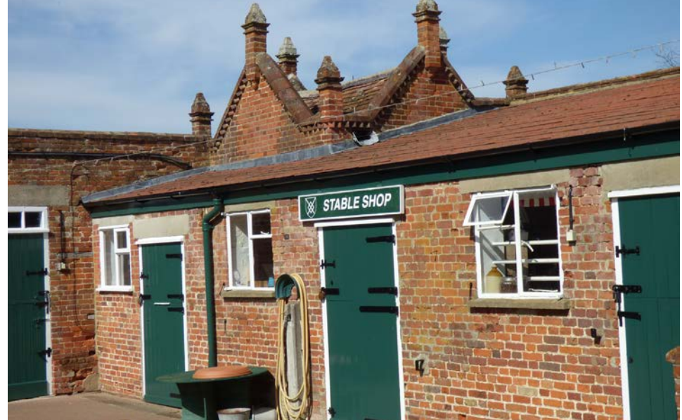
The enveloped pavilion and Stable Shop