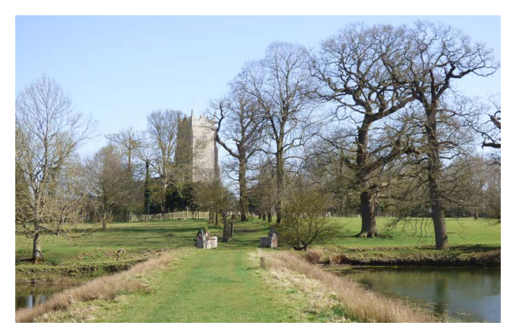
Helmingham church, approached from the park