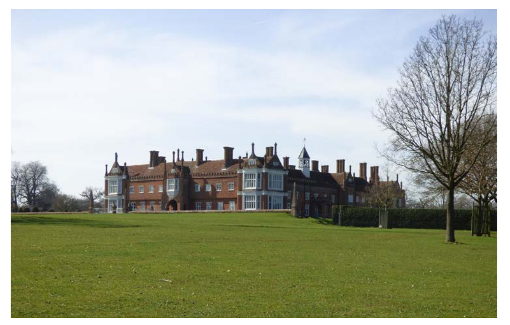
Helmingham Hall from the South (taken from the footpath between stables and church)