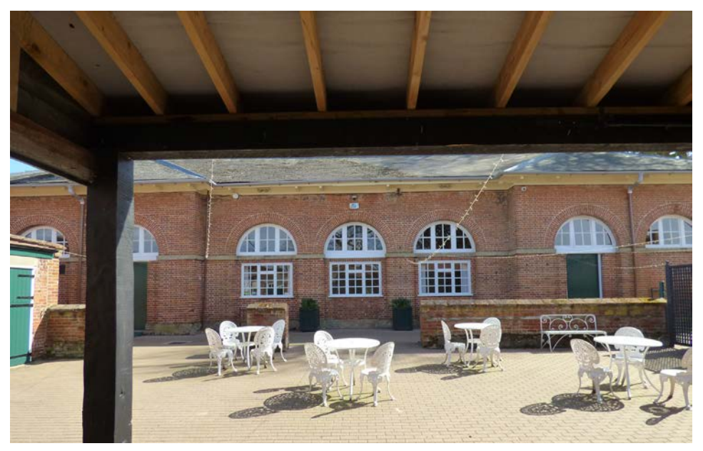
Stable Yard - view of Stables: note the central bay originally had a door (now blocked). The three ground floor windows serve the current tea room.