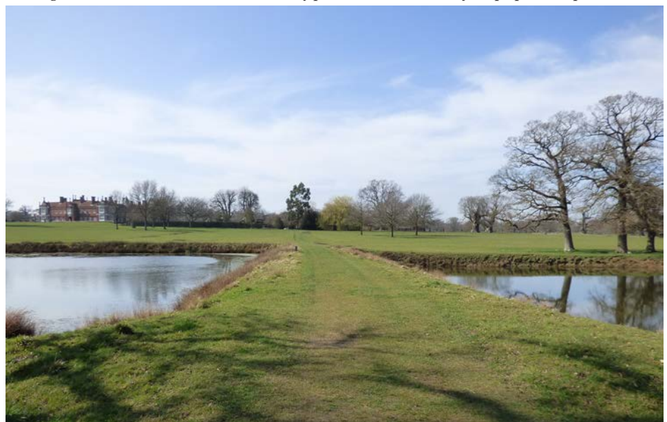
View from the church path – the Hall clearly visible on the left. The stables building group is straight ahead behind trees. The proposed car park site would be in the far distance to the right, beyond the veteran oaks