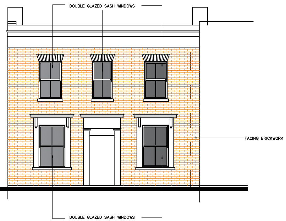
APPROVED FRONT ELEVATION