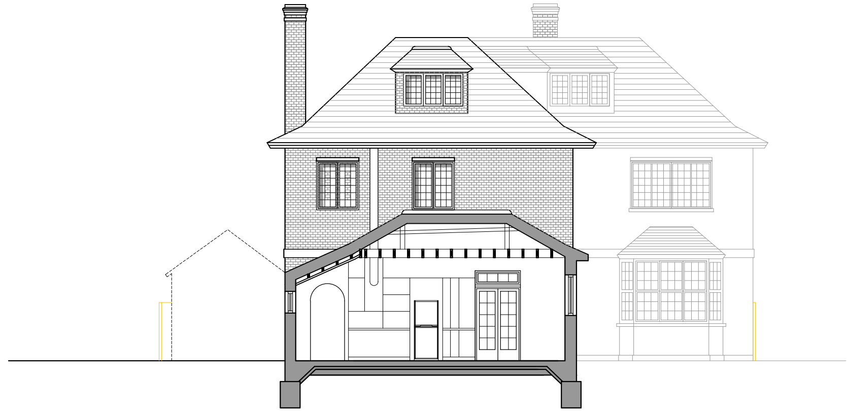
EXISTING SECTION B

1 IF IN DOUBT - ASK 2 DO NOT SCALE OFF THIS DRAWING 3 ALL DIMENSIONS ARE TO BE VERIFIED ON SITE BY THE CONTRACTOR AND ANY DISCREPANCIES REPORTED TO THE ARCHITECT BEFORE CONSTRUCTION 4 THIS DRAWING IS TO REPLACE THE PREVIOUSLY ISSUED DRAWING 5 COPYRIGHT OF THIS DRAWING REMAINS WITH THE ARCHITECT No. Date Revision - - -