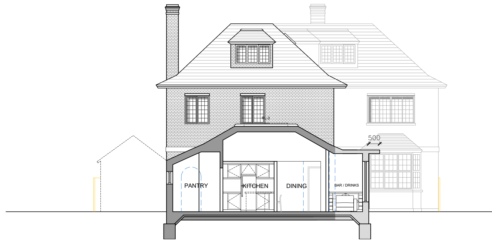
PROPOSED SECTION B