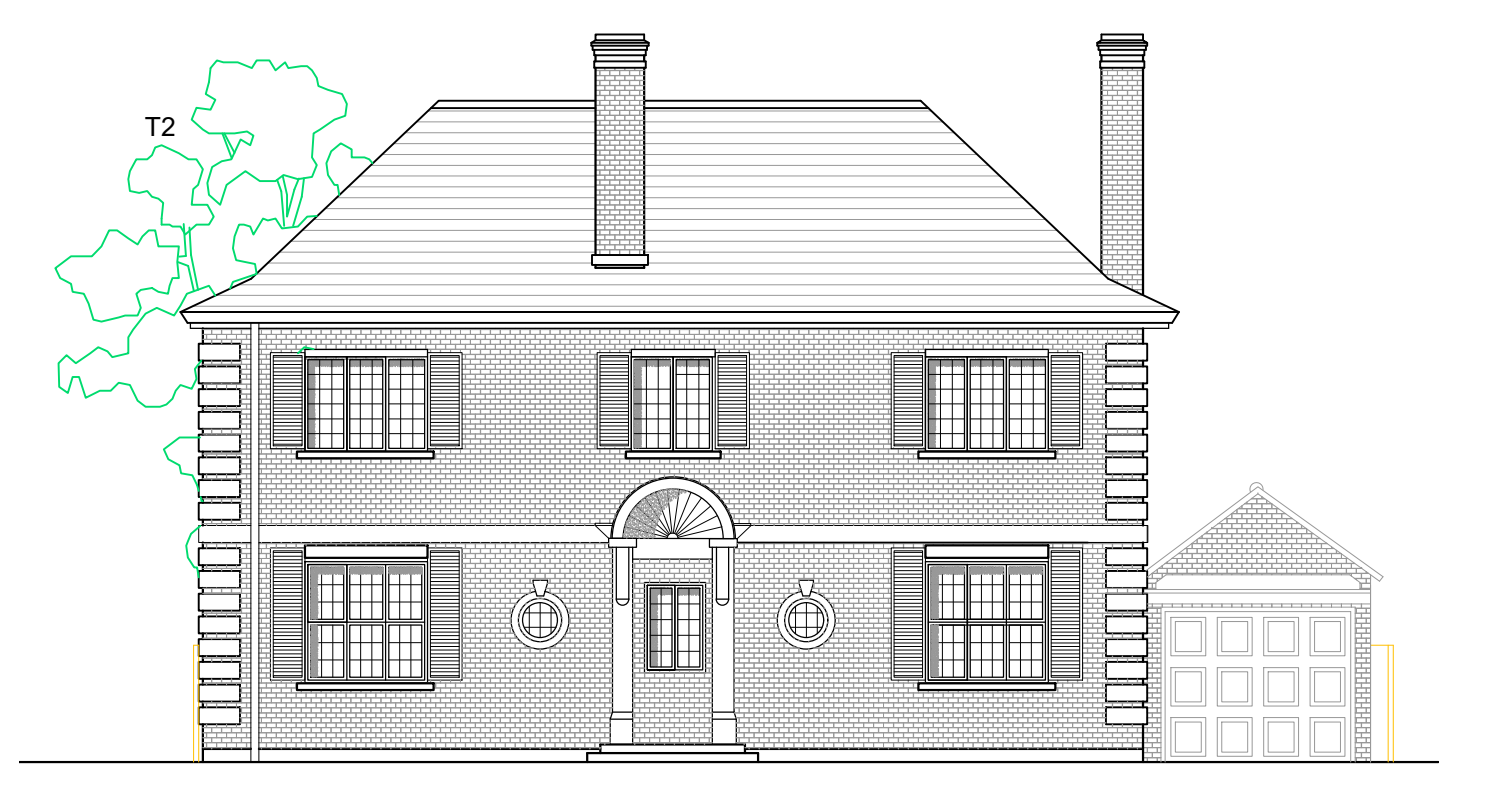
PROPOSED FRONT ELEVATION - NO CHANGES