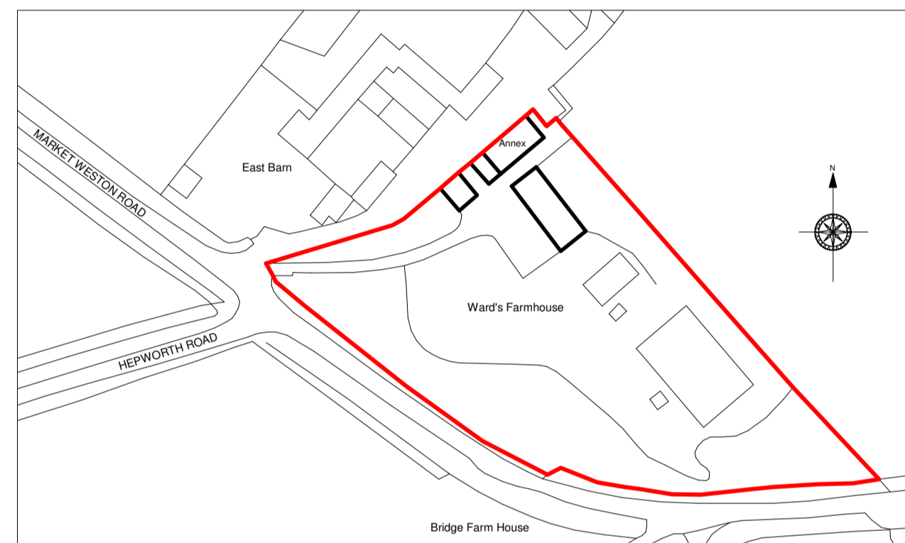
Site Location Plan 1:1250 @ A1