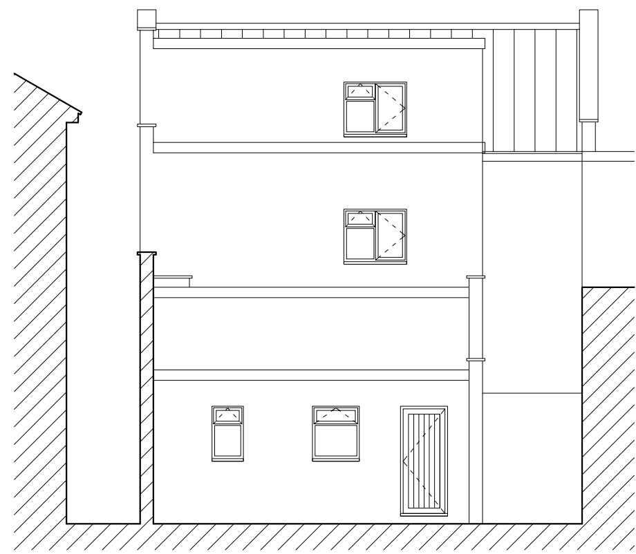
NORTH (REAR) ELEVATION

NOTES. THIS DRAWING IS COPYRIGHT. THE DRAWING IS NOT TO BE USED FOR CONSTRUCTION UNLESS MARKED 'FOR CONSTRUCTION' THE CONTRACTOR IS RESPONSIBLE FOR ALL DIMENSIONS AND THE CORRECT SETTING OUT ON SITE. ONLY FIGURED DIMENSIONS ARE TO BE USED, IF IN DOUBT ASK. ALL MATERIALS AND WORKMANSHIP TO COMPLY WITH THE CURRENT BRITISH STANDARDS AND CODES OF PRACTICE.