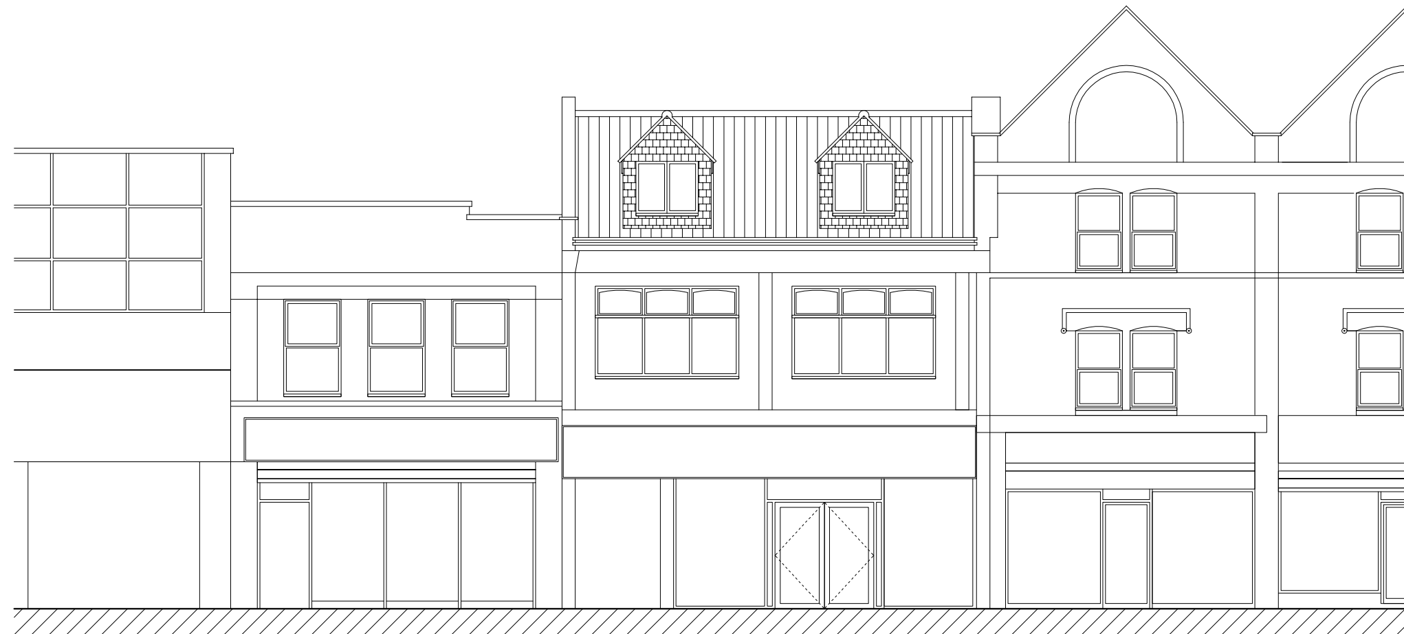
SOUTH (FRONT) ELEVATION

No. 142-146 No. 140 Application Site No. 136 No. 134