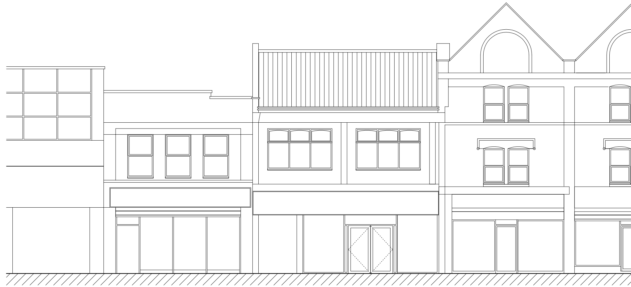
SOUTH (FRONT) ELEVATION

No. 142-146 No. 140 Application Site No. 136 No. 134