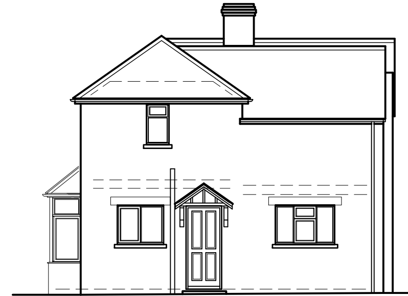
SIDE (NORTH EAST)