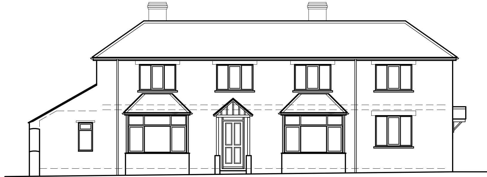
FRONT (SOUTH EAST)