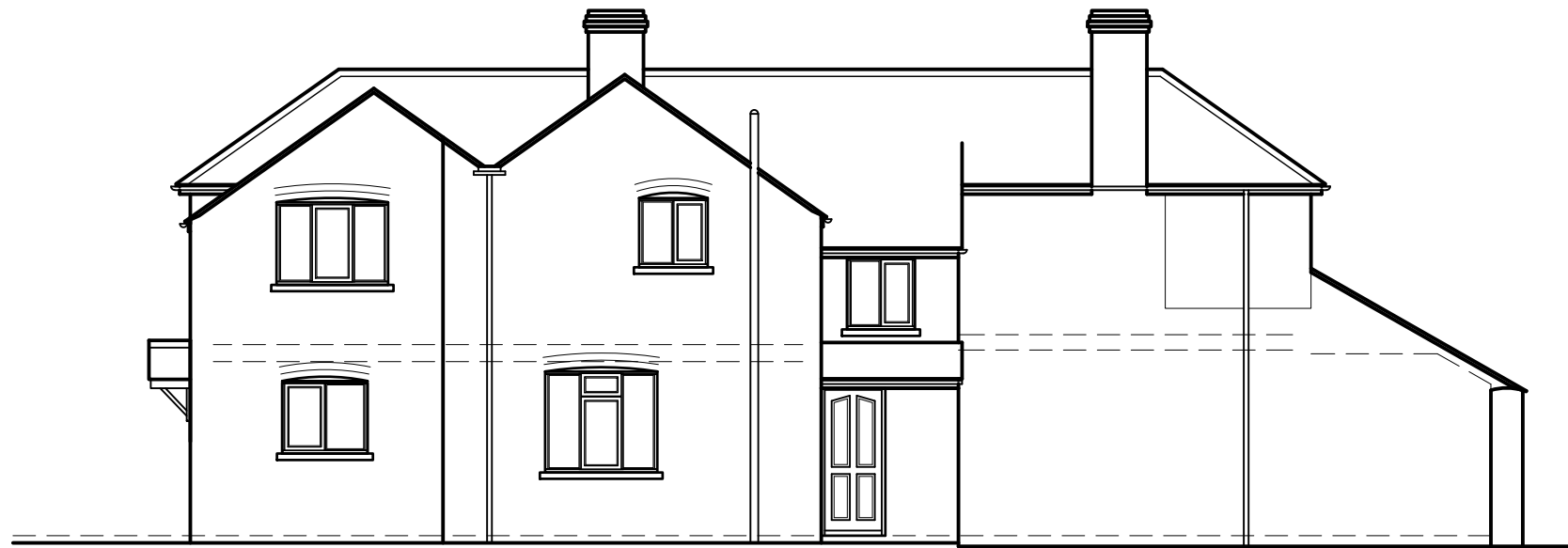
REAR (NORTH WEST)