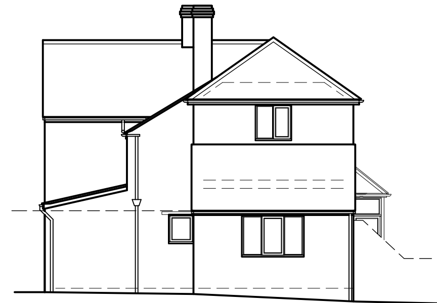
SIDE (SOUTH WEST)