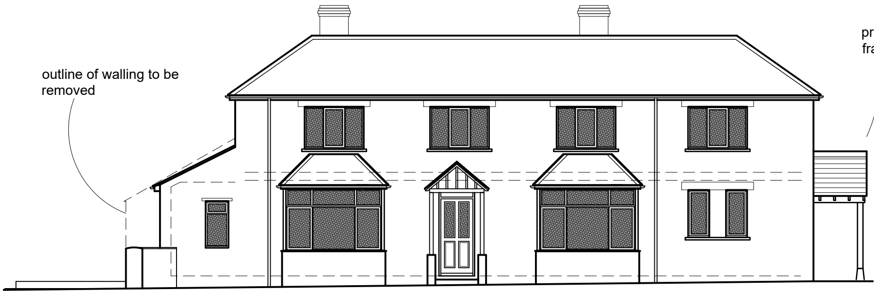
FRONT (SOUTH EAST)