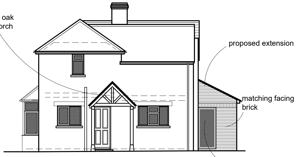
SIDE (NORTH EAST)