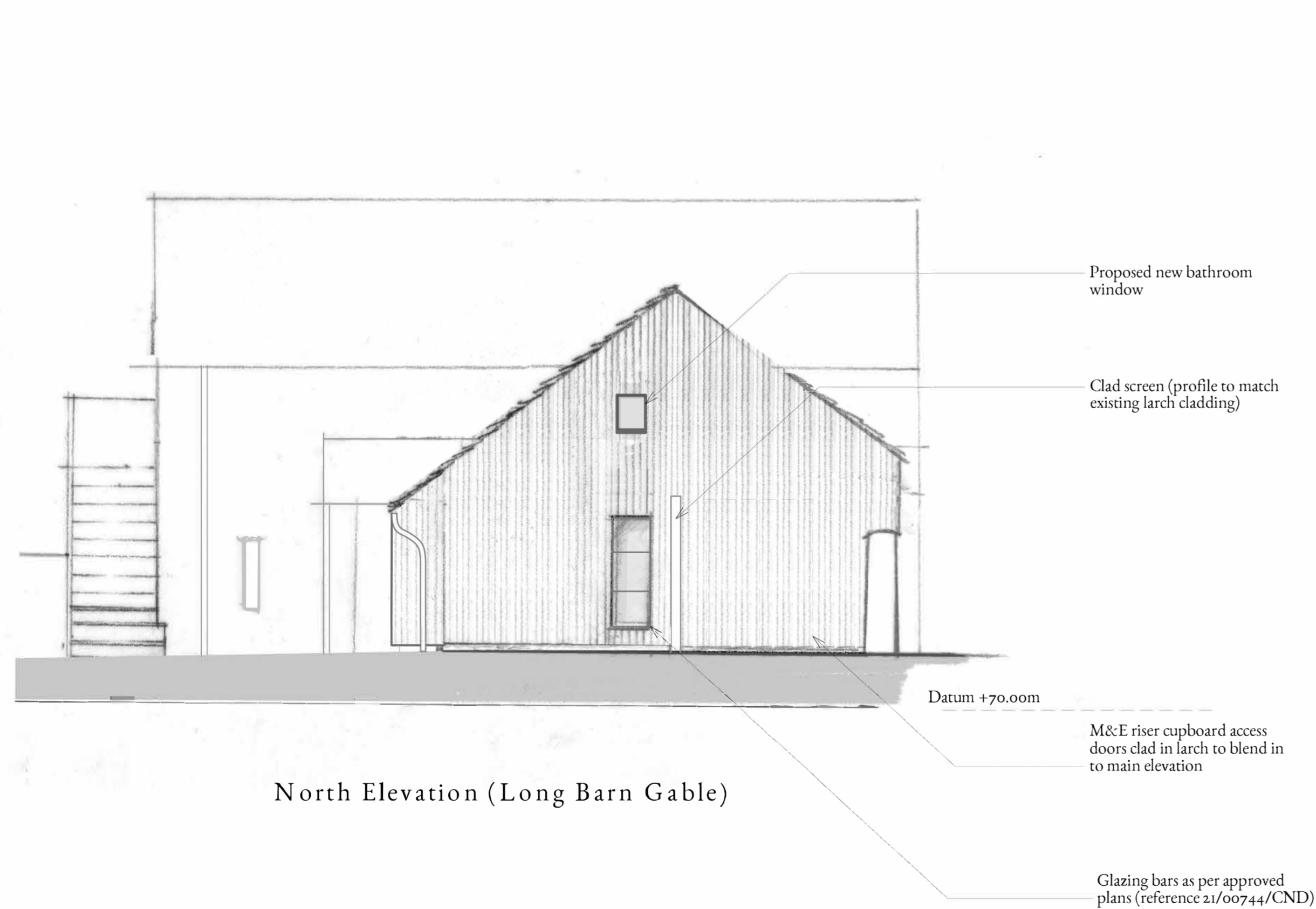
North Elevation (Long Barn Gable)