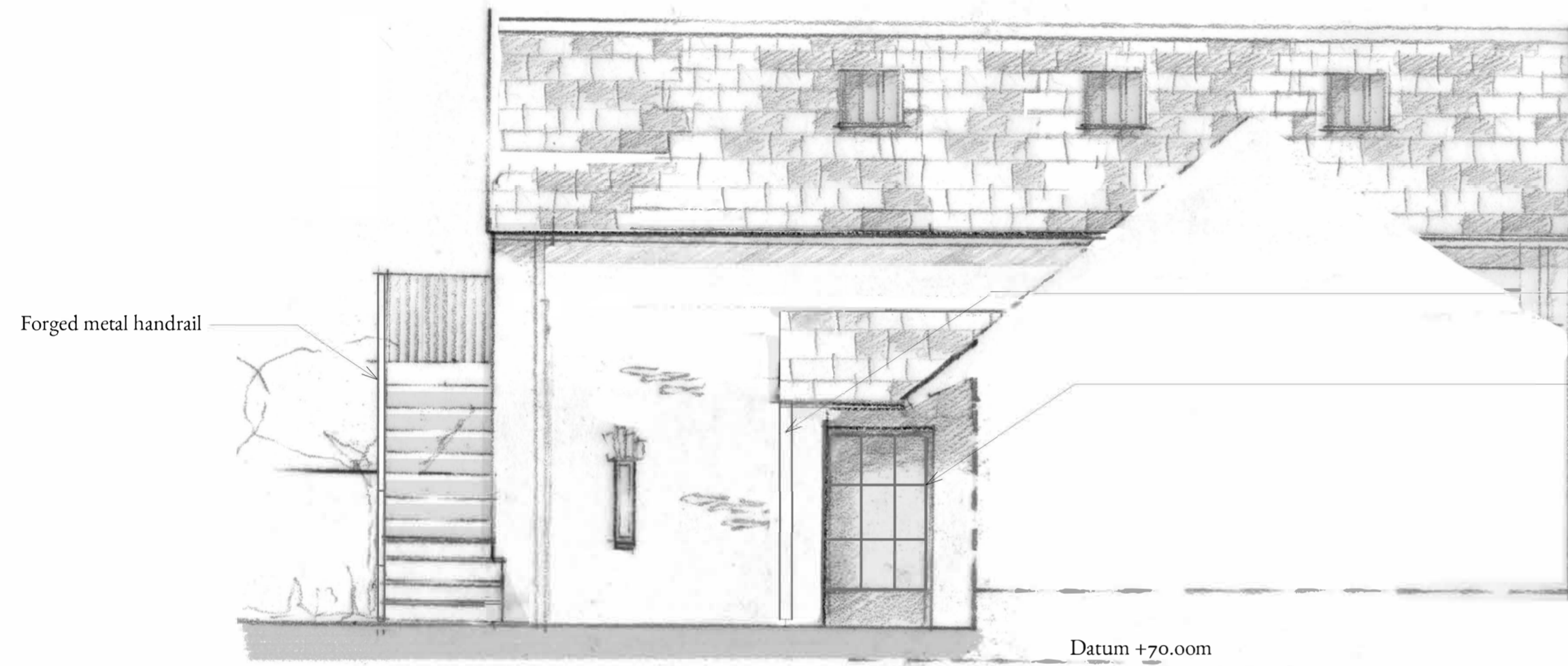
North Elevation (Entrance to Main Barn)

NOTES: These drawings are licensed representations for the purposes of planning or client concept stages. They do not form building or construction drawings. The designs within this drawing are subject to copyright by Fleming Architects. This drawing to be read in conjunction with accompanying planning documents or scheduled specifications. All drawings, notes, details and dimensions are to be checked and any discrepancies are to be reported immediately to Fleming Architects. IF IN DOUBT, ASK! Notwithstanding the representations on this drawing, if used as secondary stage drawings, all foundations and structural members to be designed to comply in all respects with the Construction and Building Acts, and all their amendments. This drawing is subject to advice from a structural engineer before implementation. Fleming Architects cannot be responsible for drawing accuracy if issued from any location other than their offices. A note to clients and contractors: it is the obligation of both client and contractor to study these drawings carefully before works commence and to report any discrepancy to the architect, and they will allocate all resources to resolving promptly. This is especially true if there is no architectural presence on site. The architect cannot take liability for unreported discrepancies falling in the duration of the project. Fleming Architects (c)