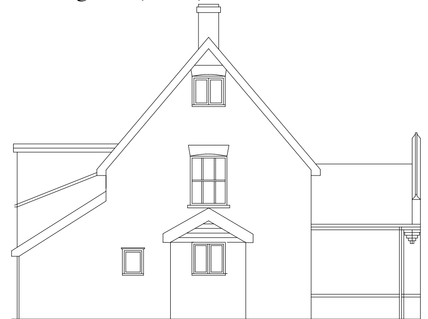
Proposed Side (North)

new roof structure in line with existing roof, clay pantiles, existing walls retained, new purpose made joinery