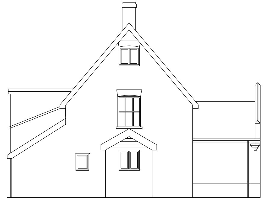
Existing side (North)