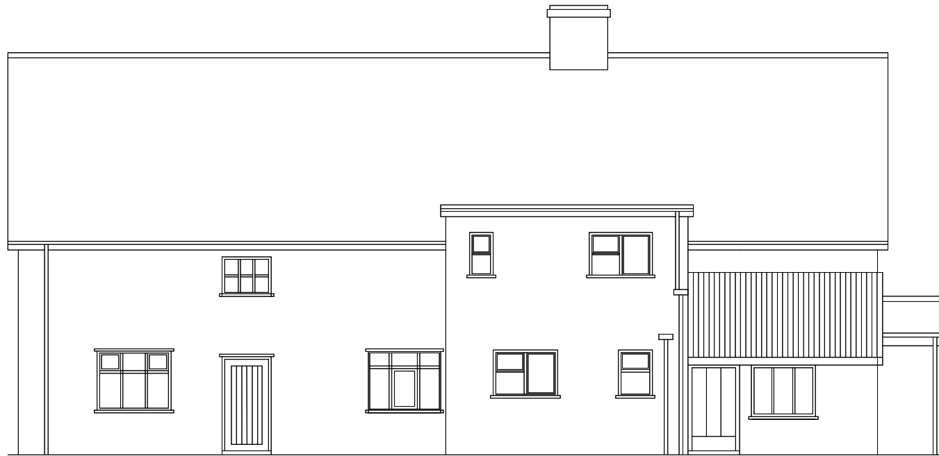
Existing Rear (East)