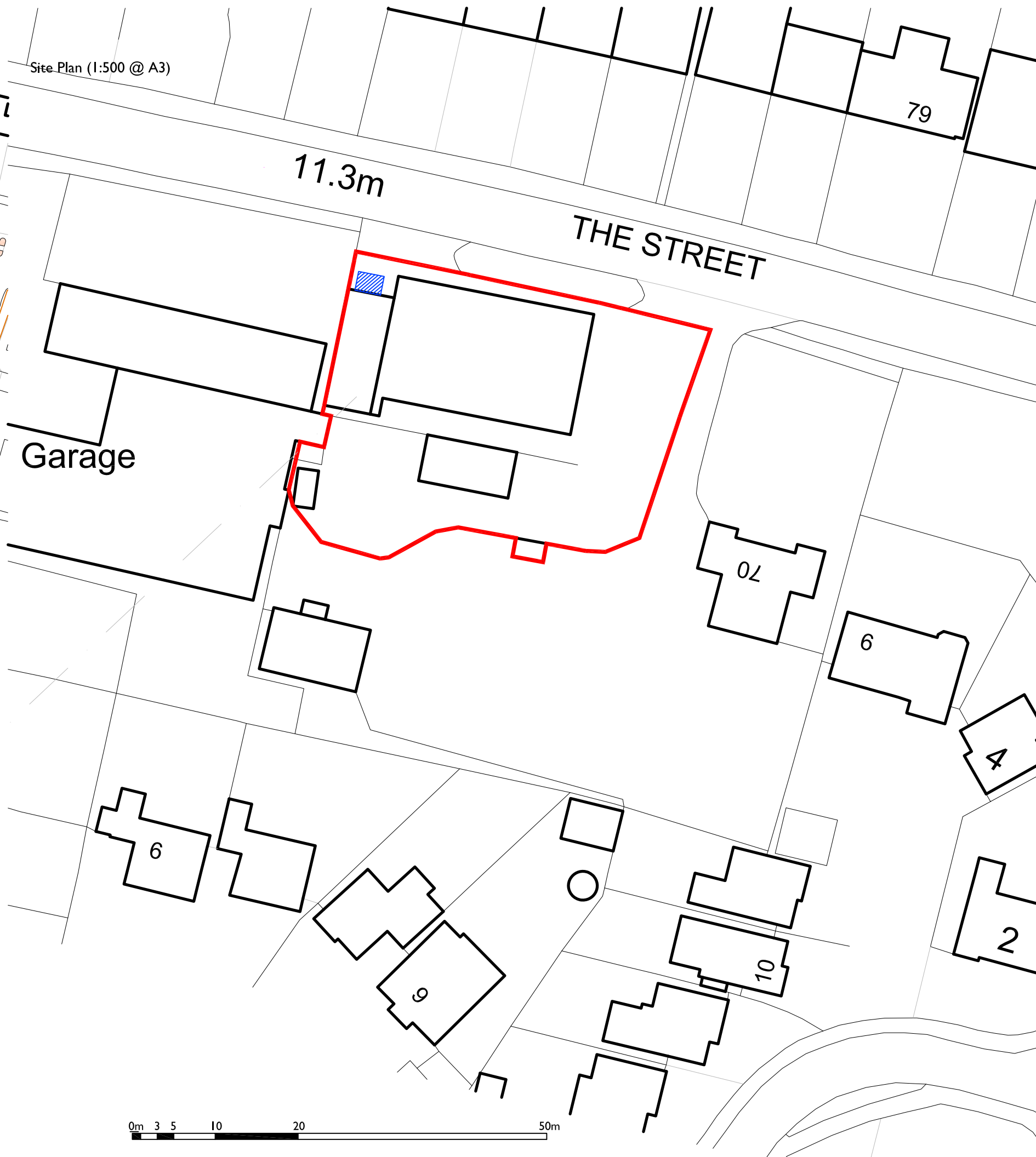
Site Plan (1:500 @ A3)

Additional approvals, information and actions may be required prior to construction including (but not limited to) in relation to Advertisement Consents, the Party Wall Act, Building Regulations, CDM 2015 Regulations, Demolition Act, Insurance, Building Contract, Discharge of Planning Conditions, Protected Species and Trees etc. This drawing is to be used solely for the purposes of seeking planning approval and does not contain all of the detail or information necessary for other purposes, approvals or construction.