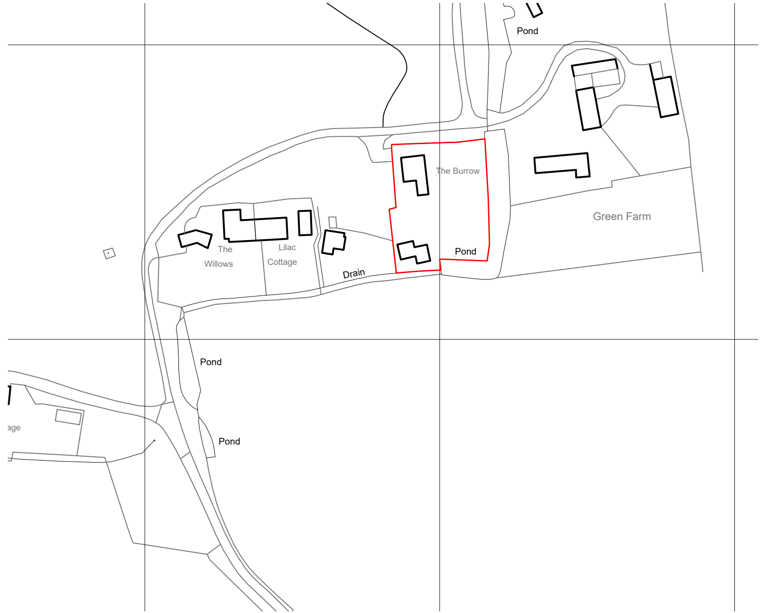
Location plan 1:1250