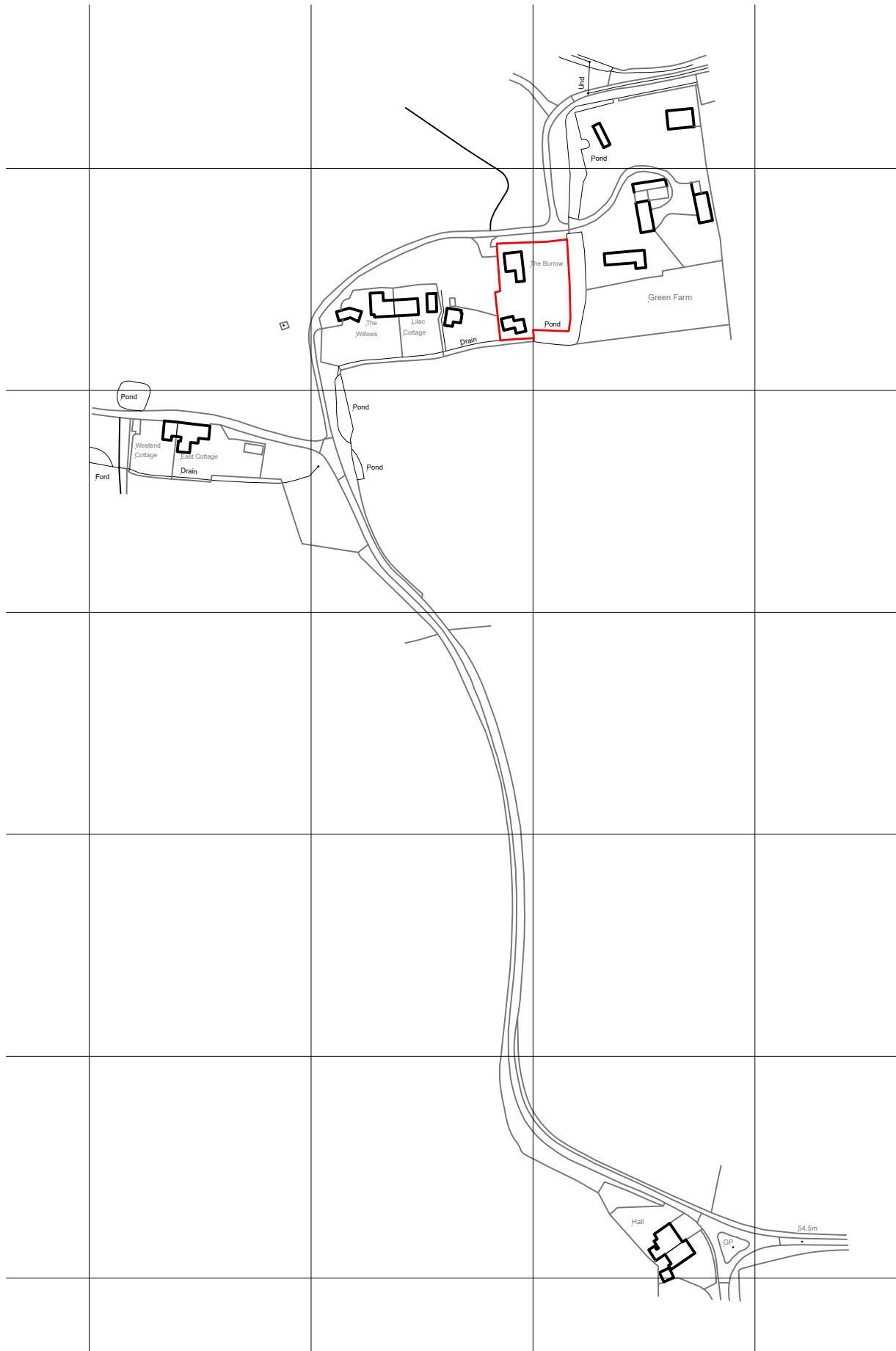
Location plan 1:2500