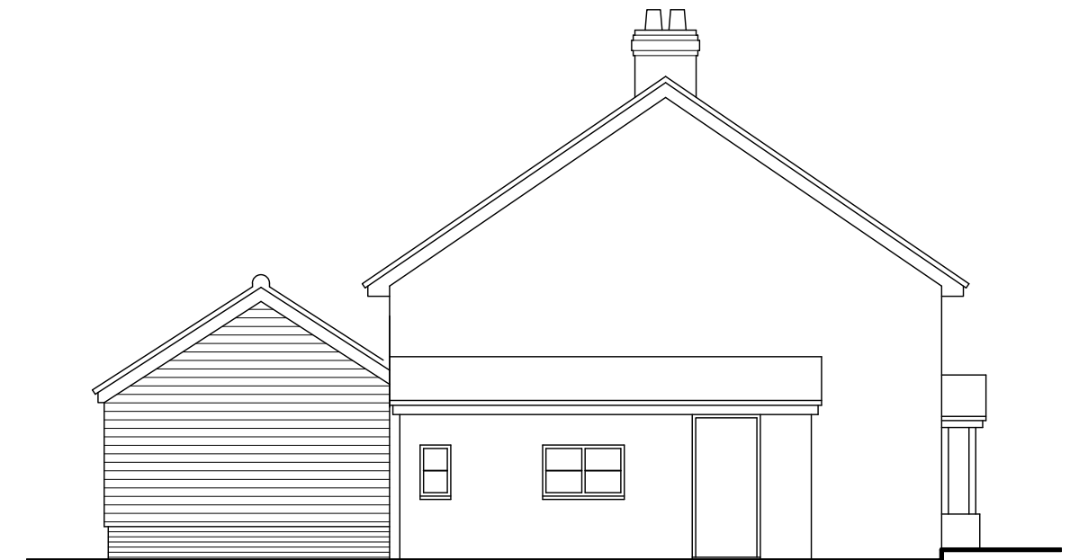
North elevation 1:100