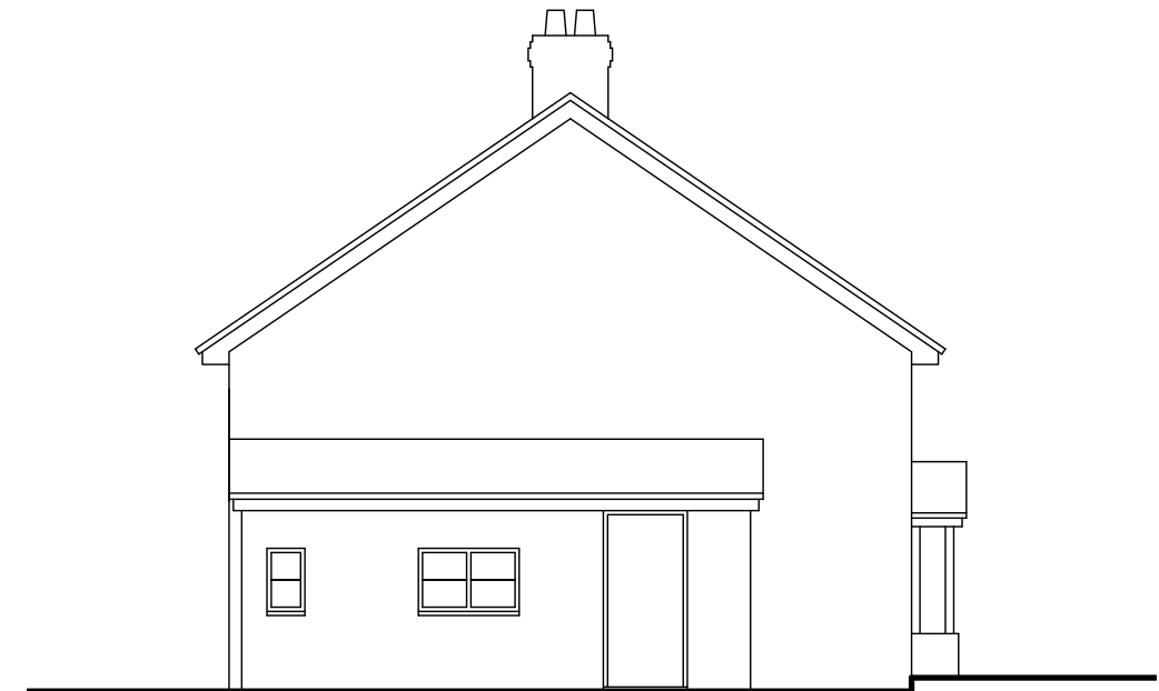
North elevation 1:100