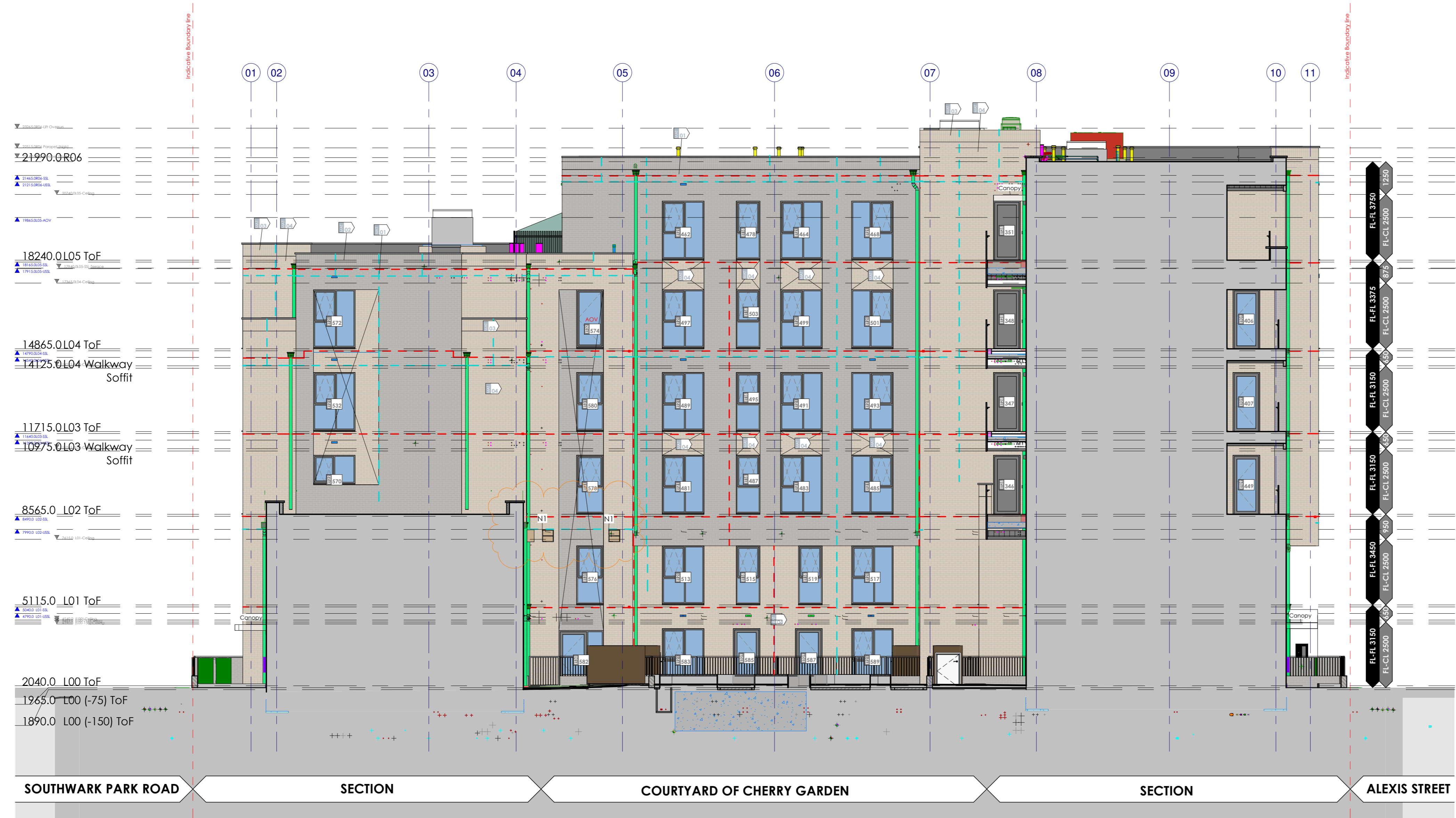
Courtyard West Elevation 1 : 100