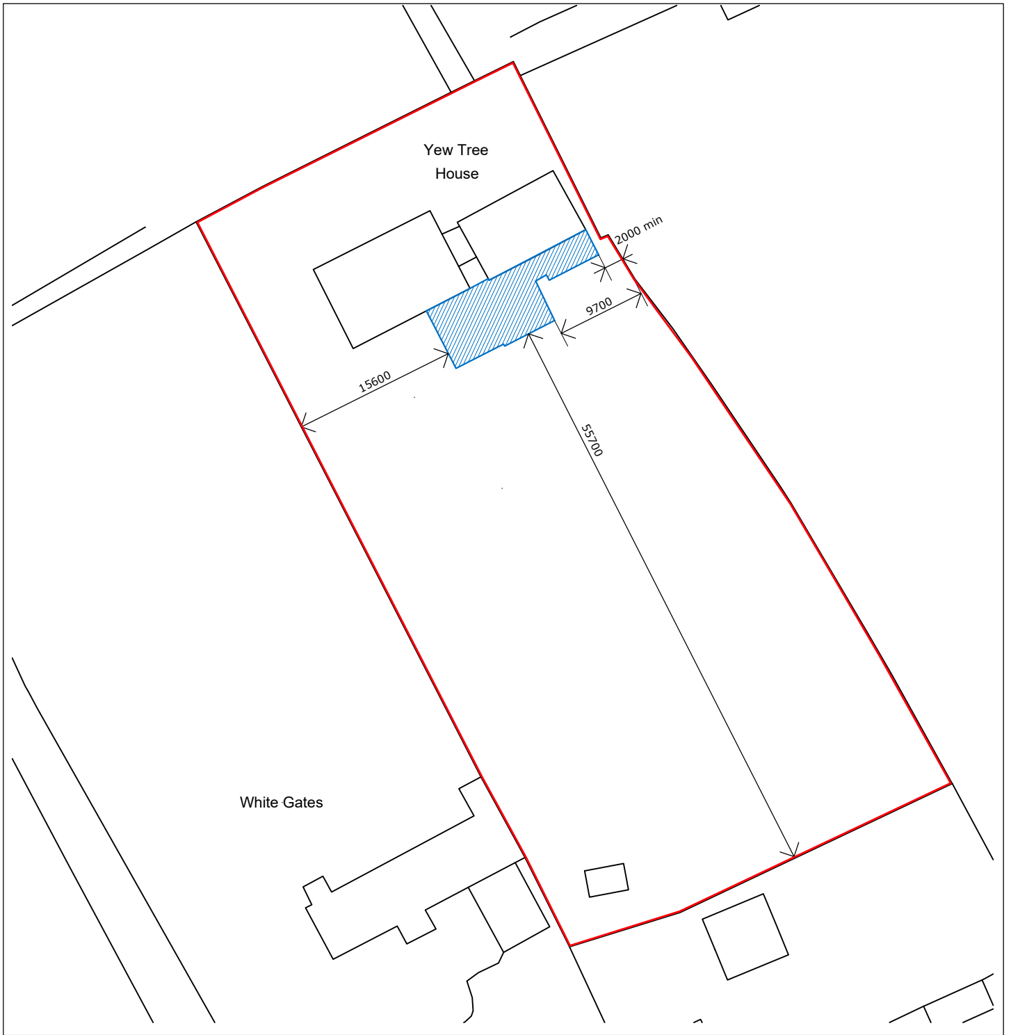
BLOCK PLAN 1:500 @ A4 Dimensions based on OS plan.