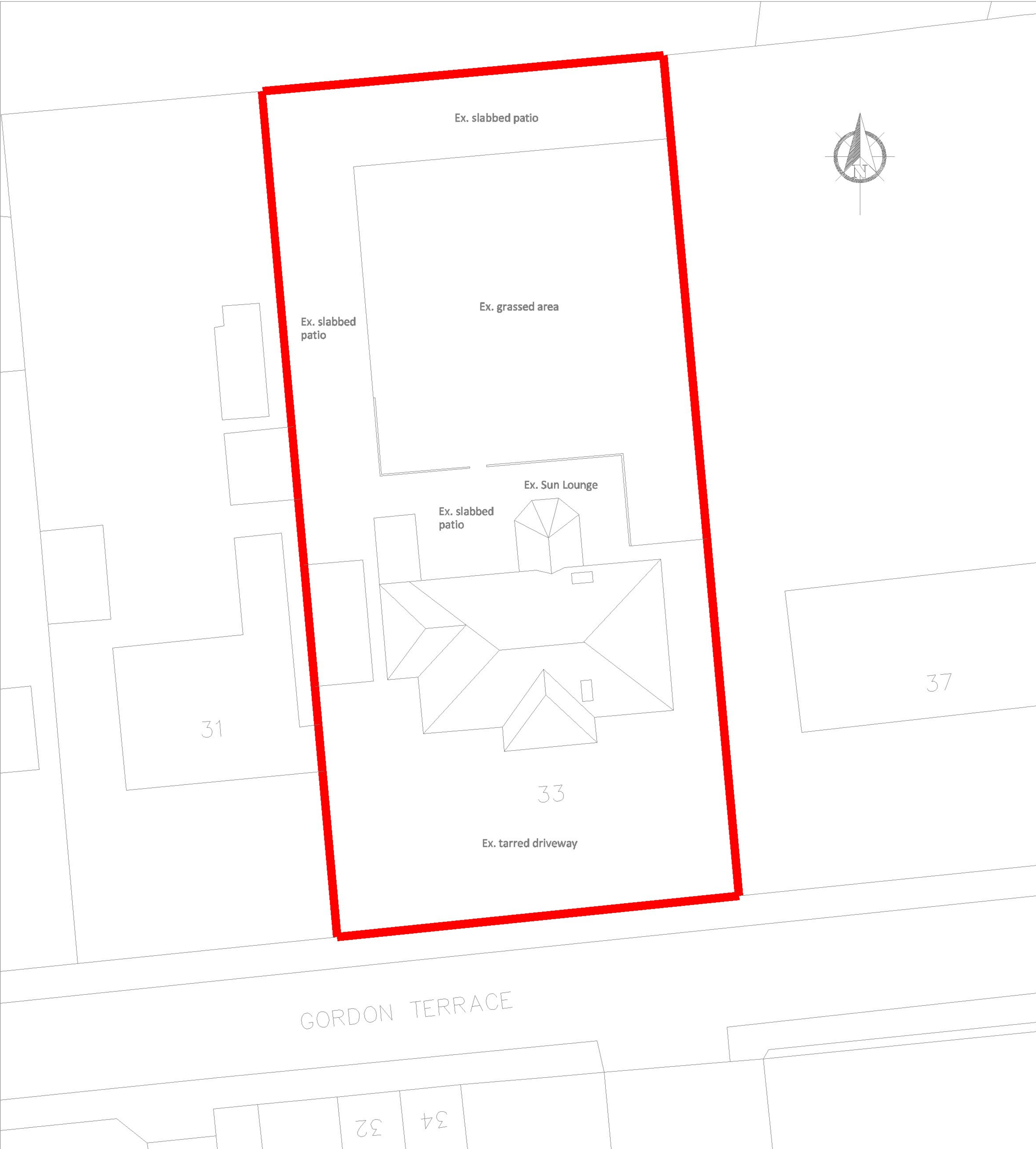
Existing Site Plan Scale 1:250