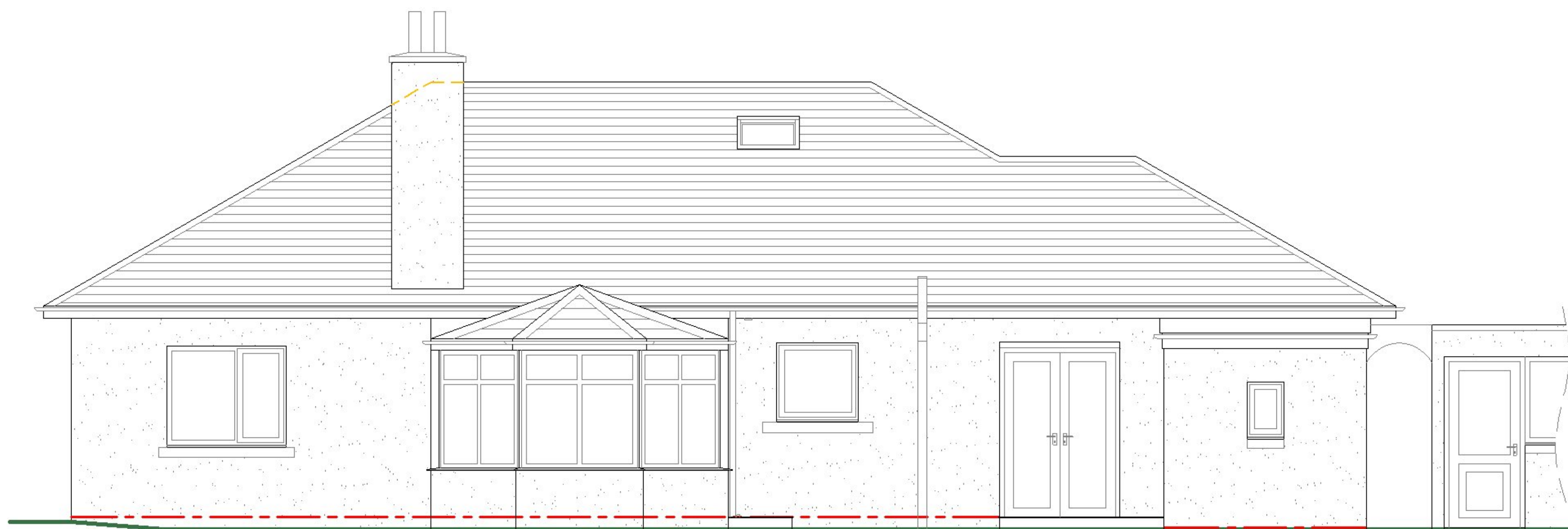
Existing North West Elevation (1:100)