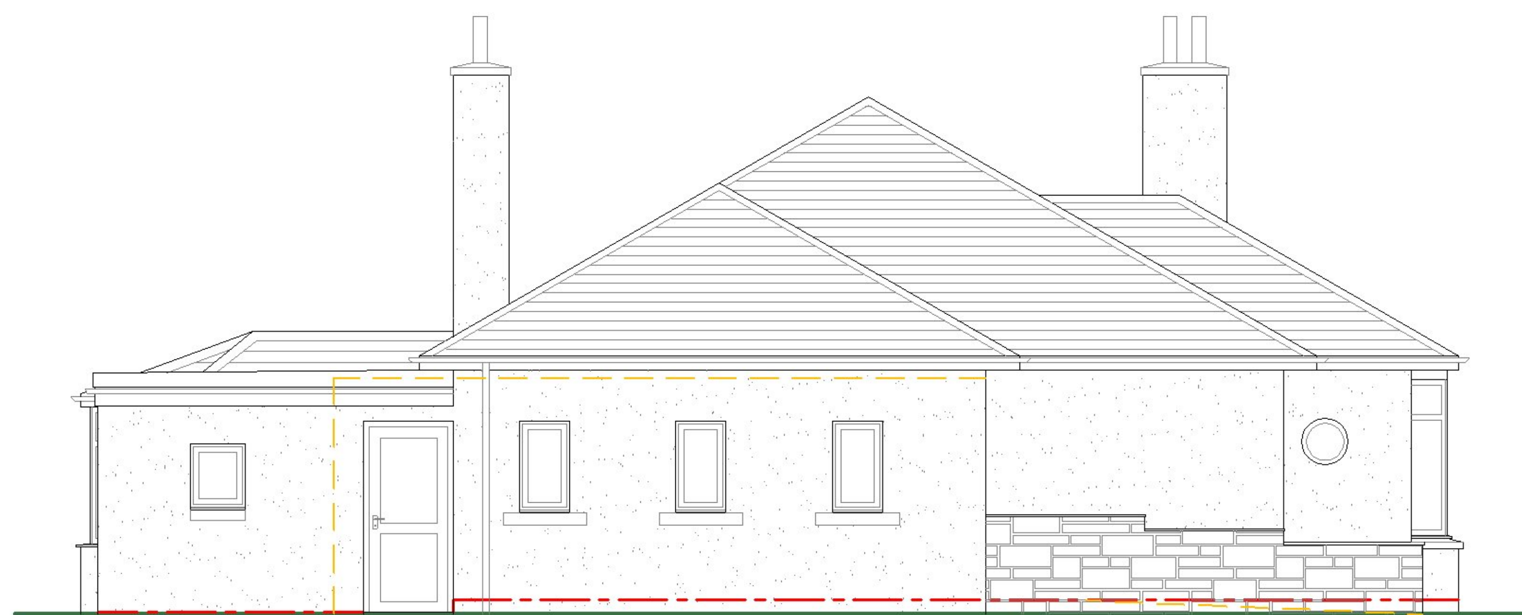
Existing South West Elevation (1:100)

ALL ELECTRICAL WORK TO BE CARRIED OUT IN STRICT ACCORDANCE WITH THE LATEST I.E.E REGULATIONS AND TO COMPLY WITH BS7671: 2008 'THE REQUIREMENTS FOR ELECTRICAL INSTALLATIONS'.