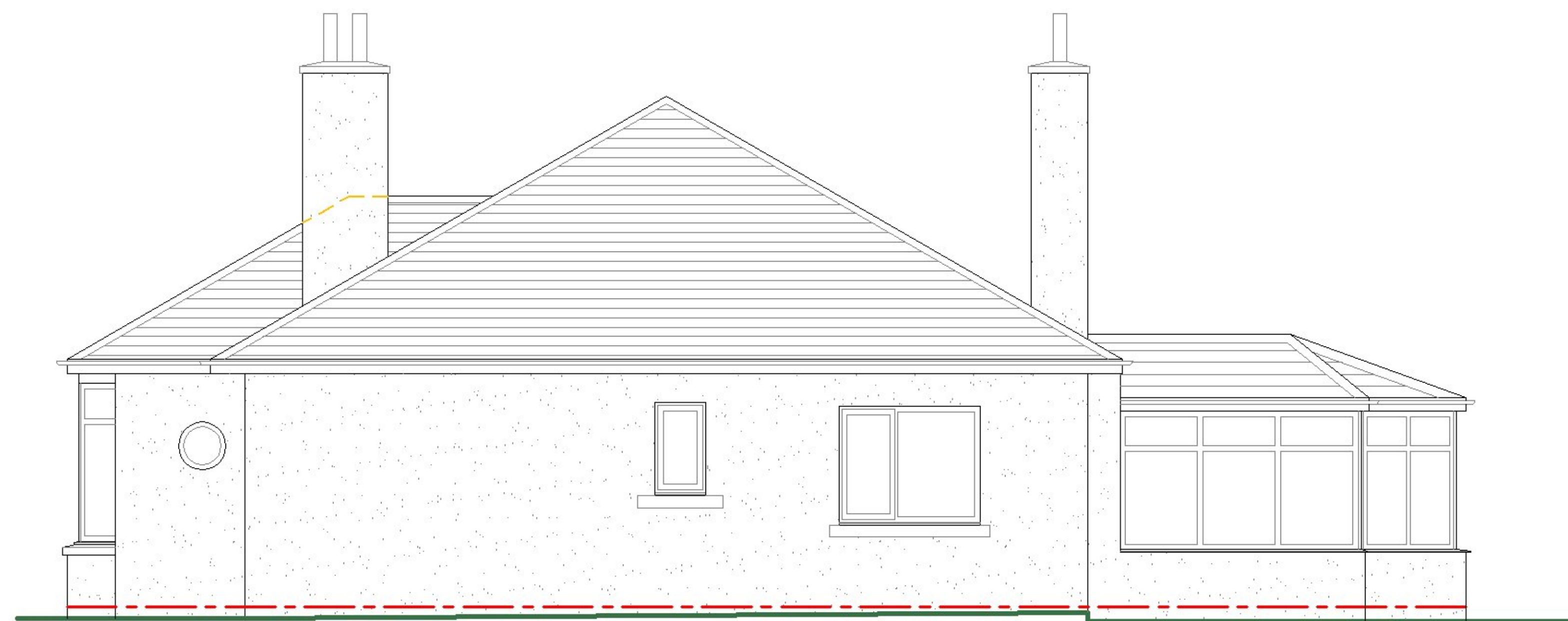
Existing North East Elevation (1:100)