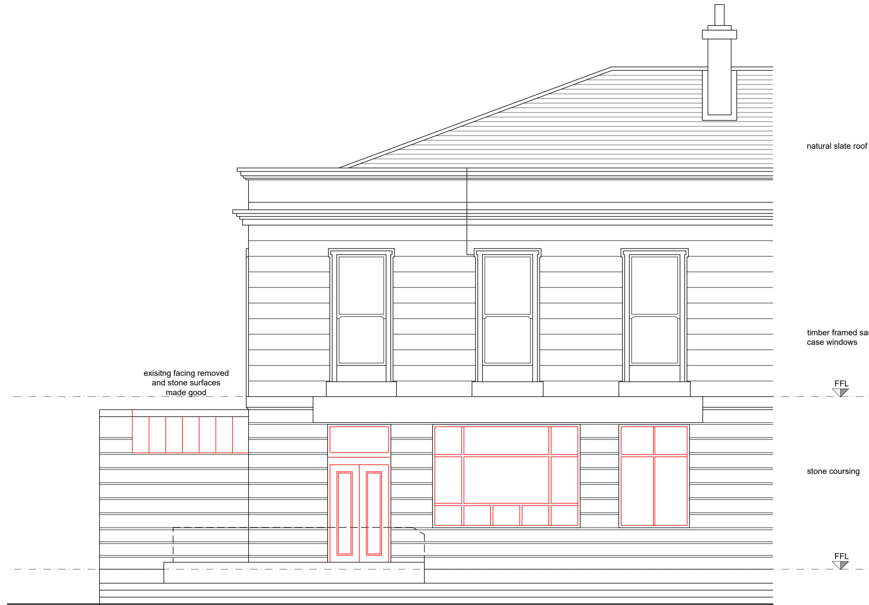
SOUTH ELEVATION AS EXISTING