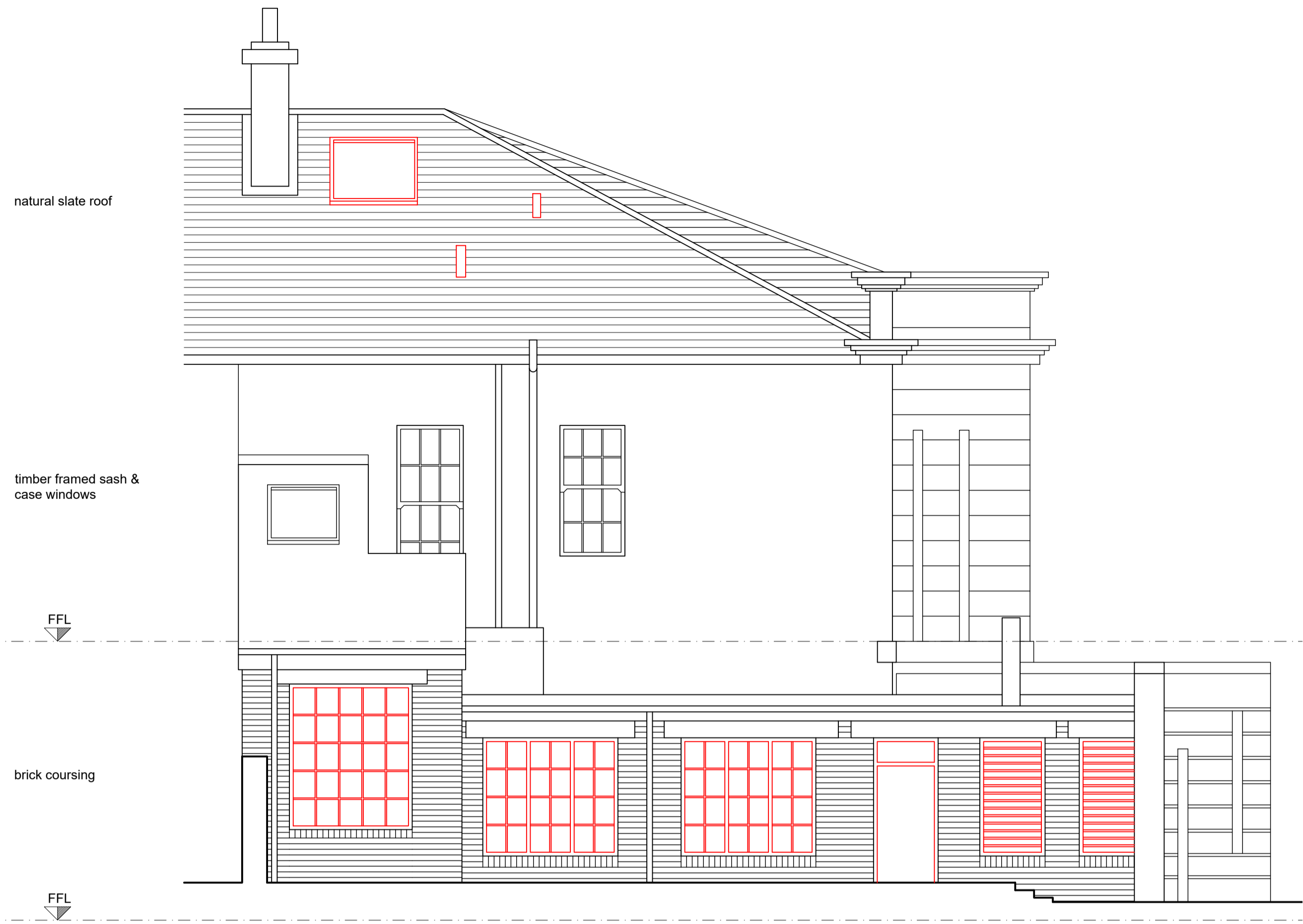
NORTH ELEVATION AS EXISTING