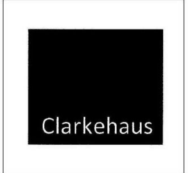
Block Plan Scale 1:200