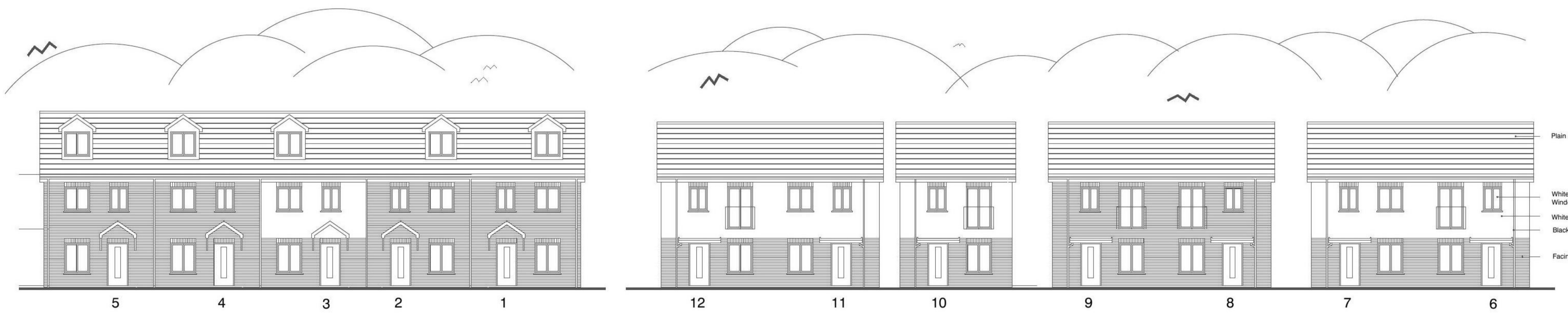
High Street Plots 1 - 5 Scale 1:100 Type 2