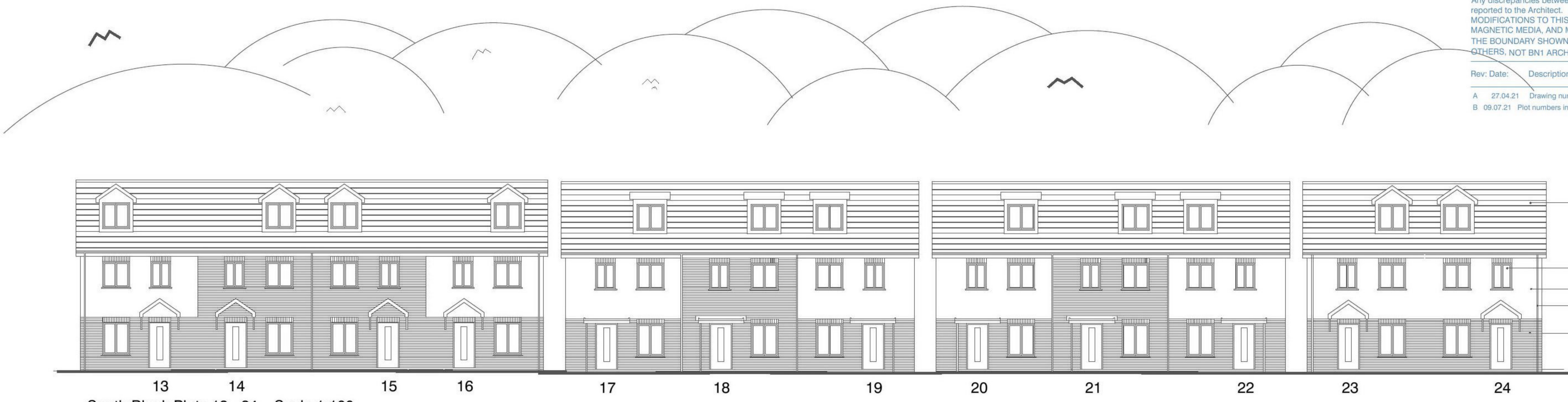
South Block Plots 13 - 24 Scale 1:100 Type 2