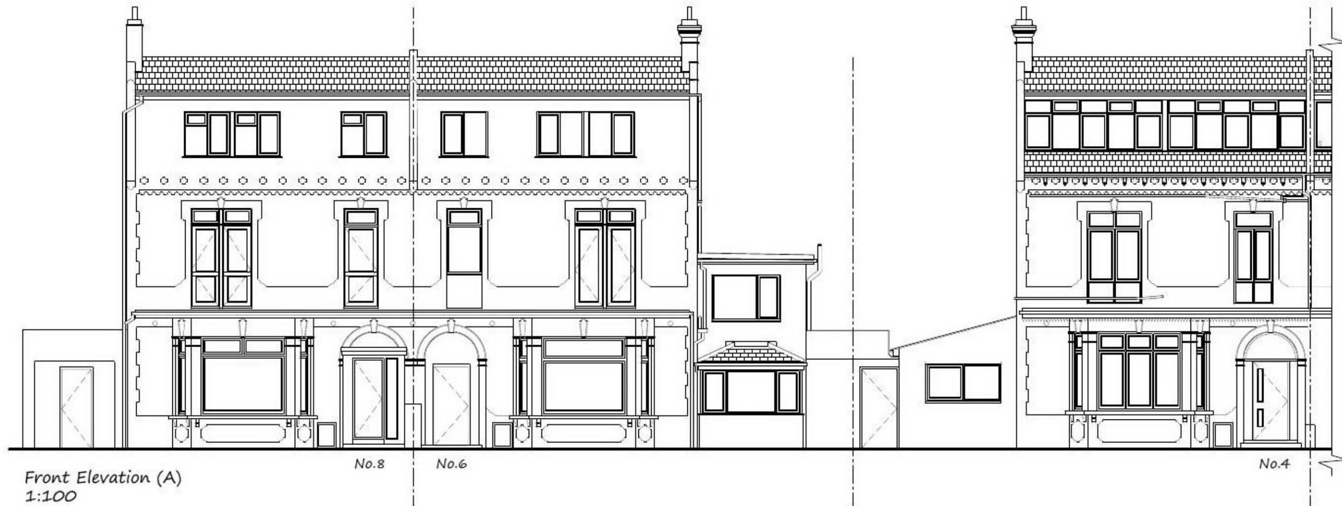
Front Elevation (A) 1:100