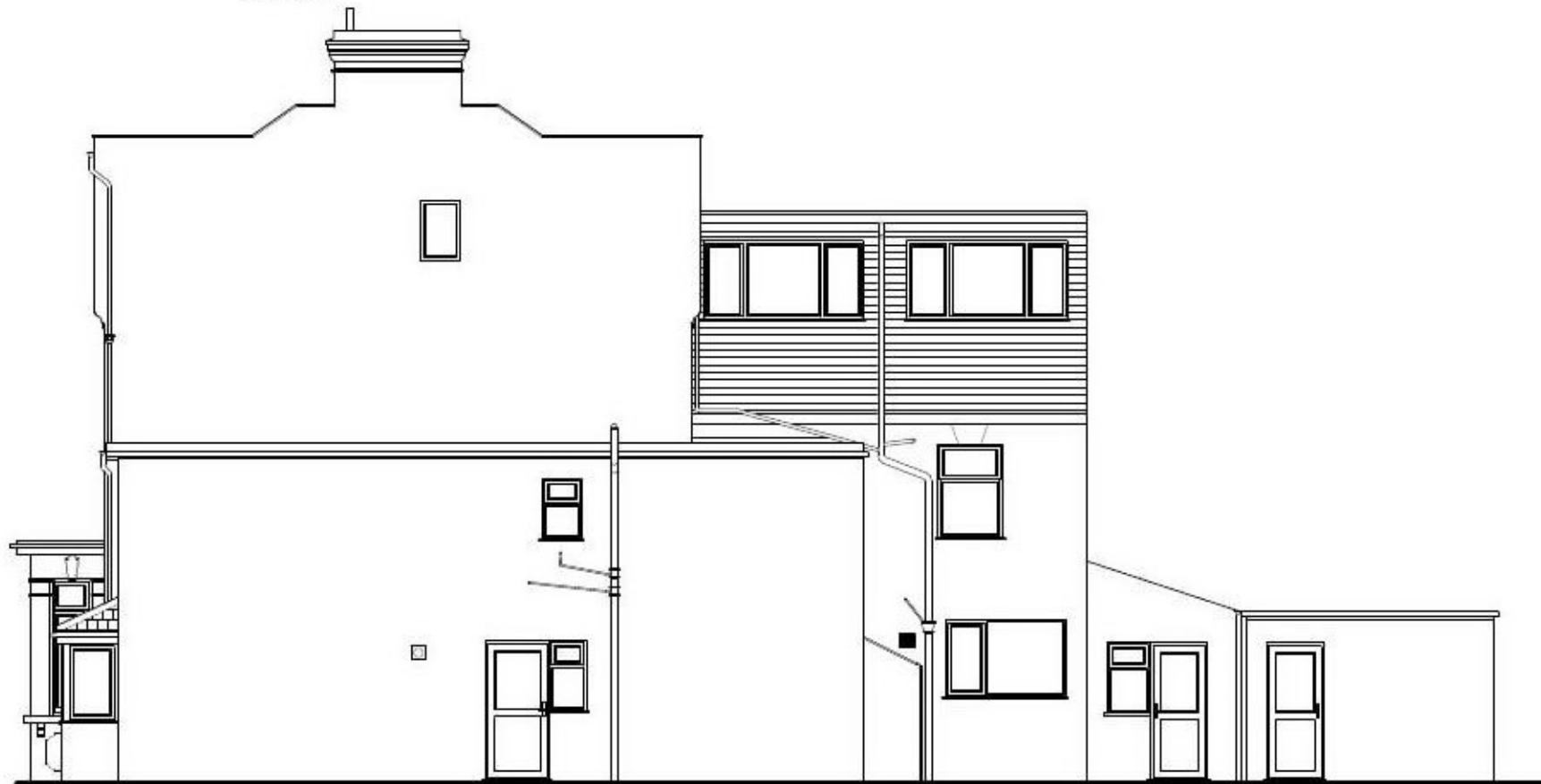
No.6 Side Elevation (D) (No.6) 1:100