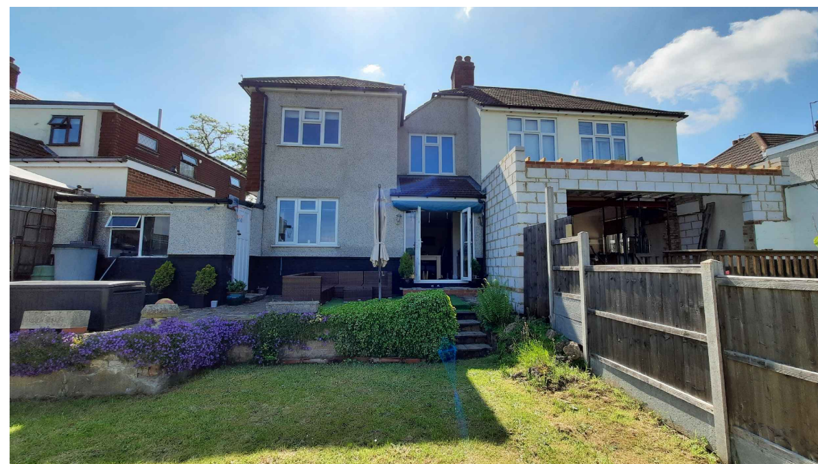
01 SITE PHOTOS SCALE NA @A3