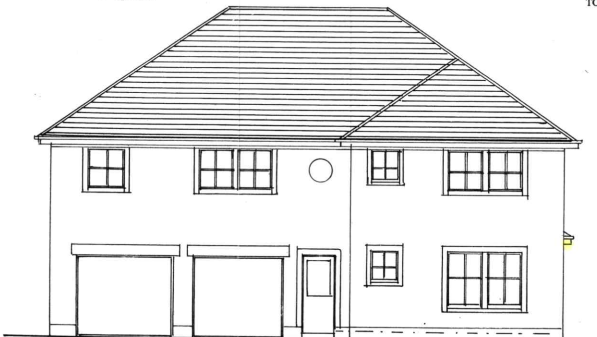
FRONT ELEVATION As proposed

WALLS WALLS DRY-DASH RENDER Colour:- White TO MATCH EXISTING PROPERTY.