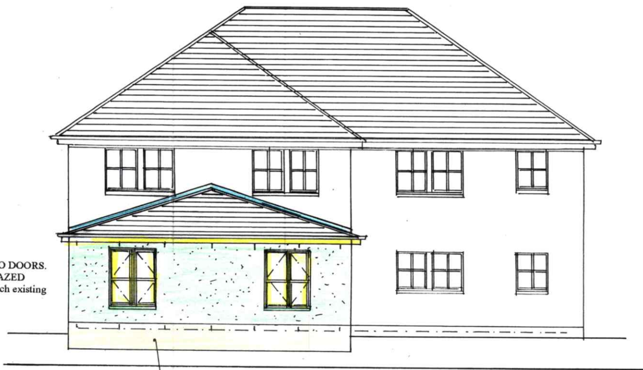
REAR ELEVATION As proposed

WINDOWS & PATIO DOORS. UPVC DOUBLE GLAZED Colour :- White to match existing