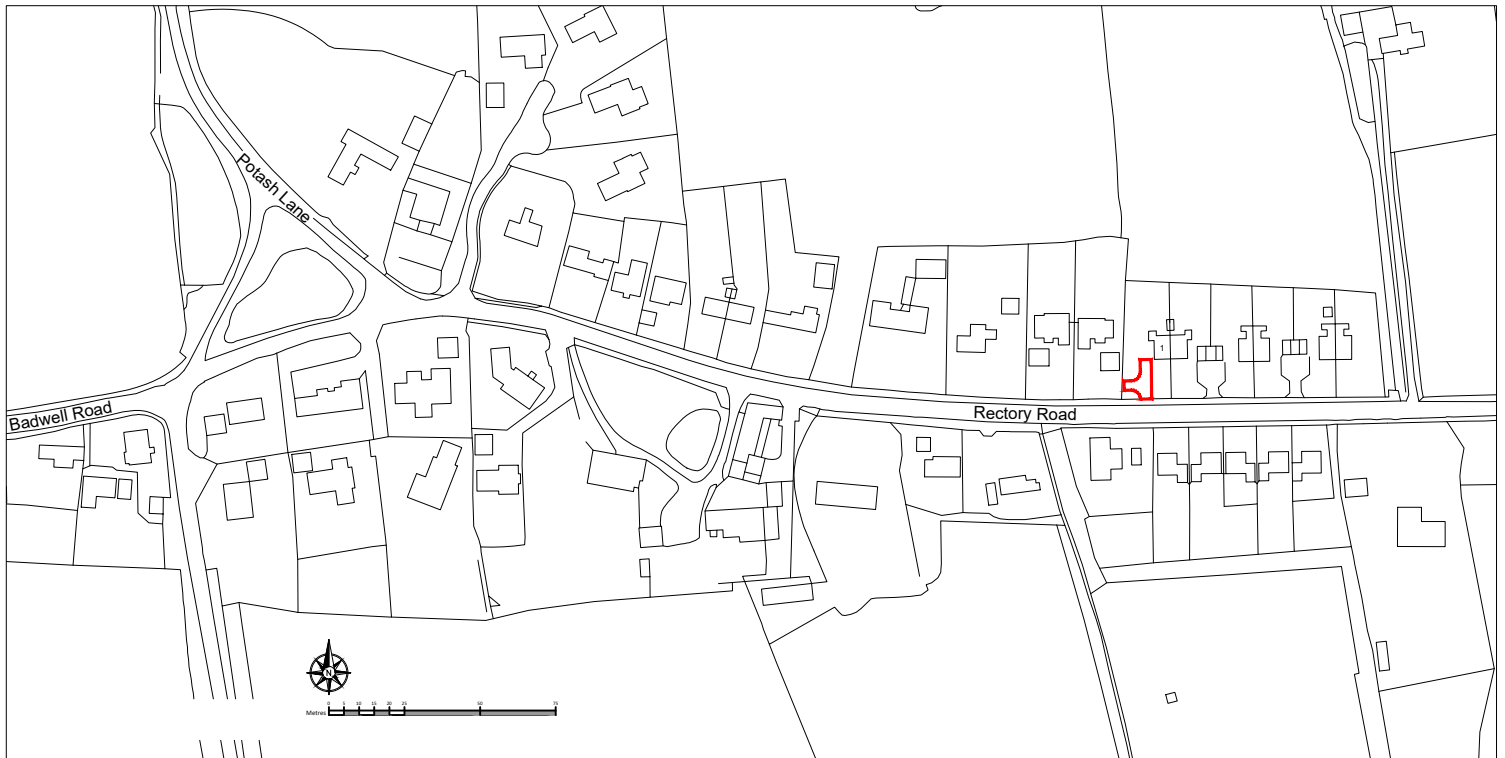
Location Plan Scale 1:2500

This drawing must not be reissued, loaned or copied without the written consent of the originator. All errors, omissions, discrepancies should be reported to the originator immediately. All dimensions to be checked before site fabrication by the contractor, his sub-contractor or supplier. Do not scale plans - use figure or grid dimensions where given. Any deviation from the drawing to be reported to the originator immediately.