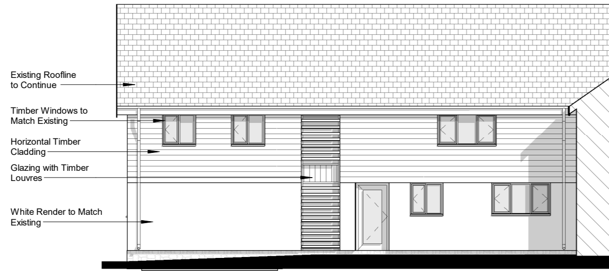
Proposed Front Elevation 1 : 100

Any surveyed information incorporated within this drawing cannot be guaranteed as accurate unless confirmed by a fixed dimension. All dimensions are in millimetres unless noted otherwise.