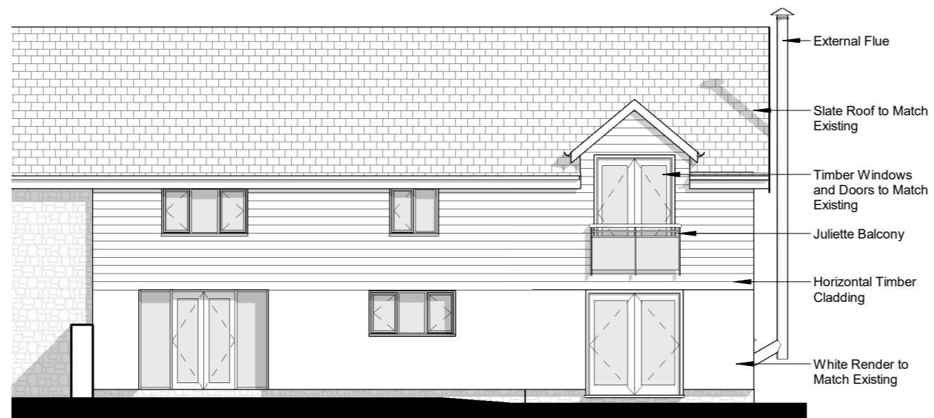
Proposed Rear Elevation 1 : 100