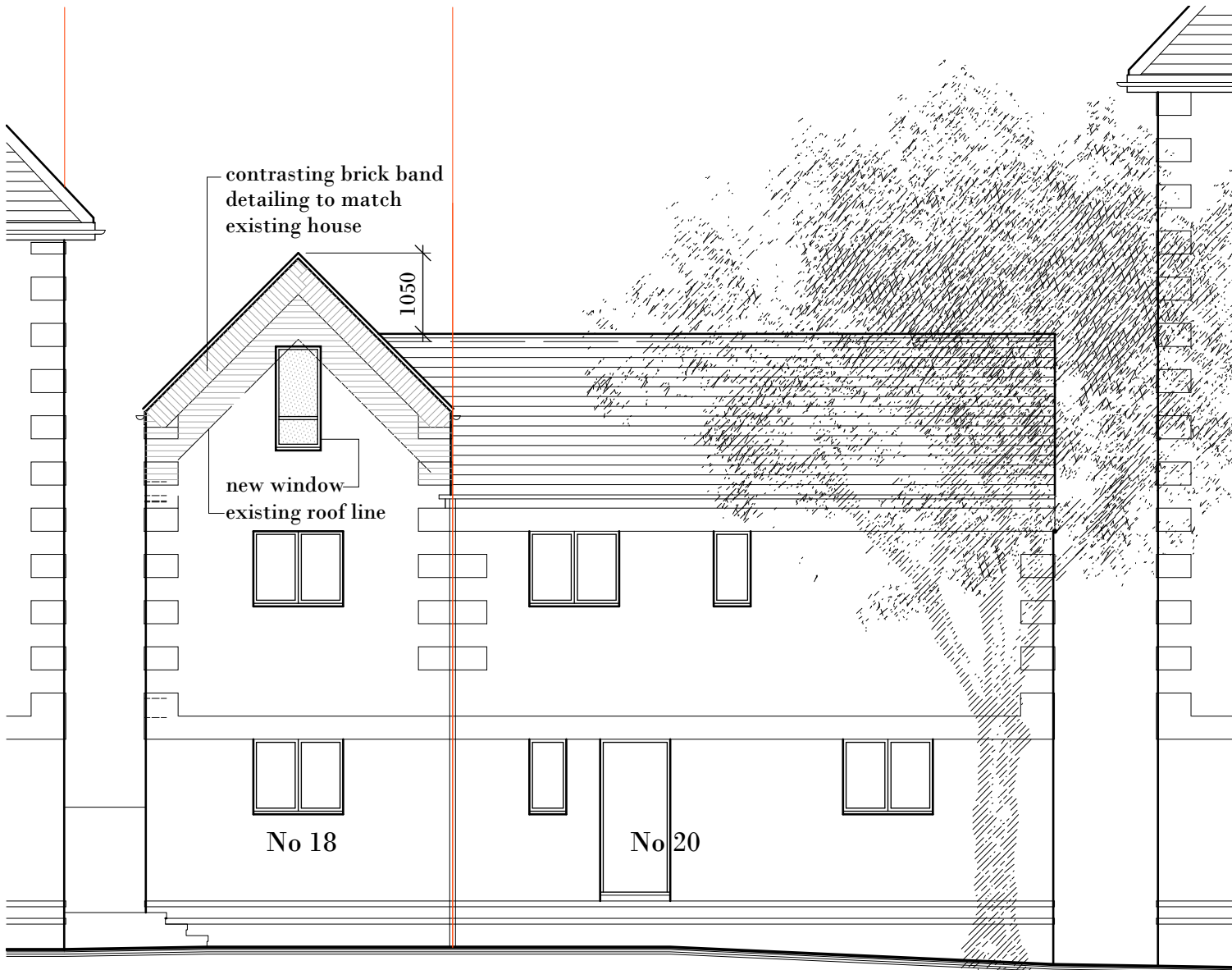
Front Elevation (NE)

Designs subject to site survey and statutory approval.