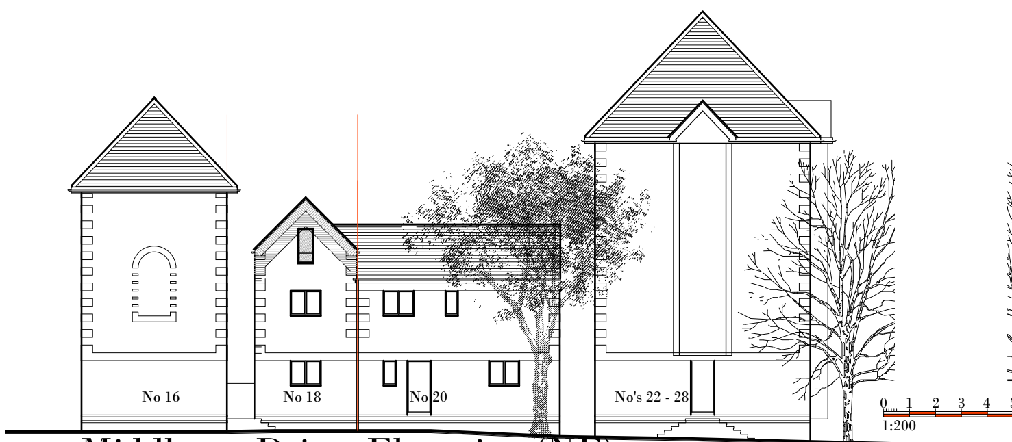
Middleton Drive Elevation (NE)