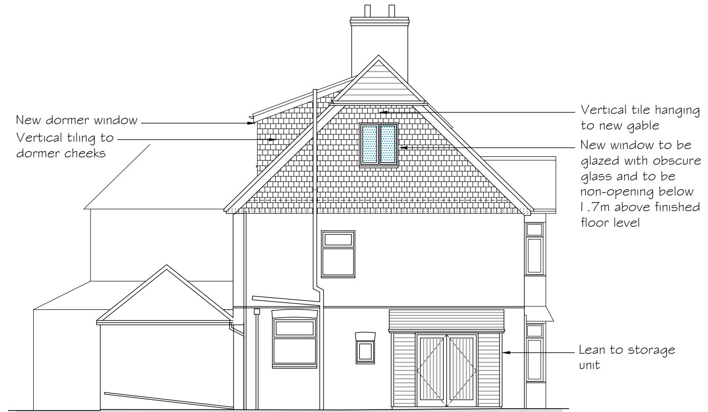
PROPOSED NORTH WEST ELEVATION @ 1:100