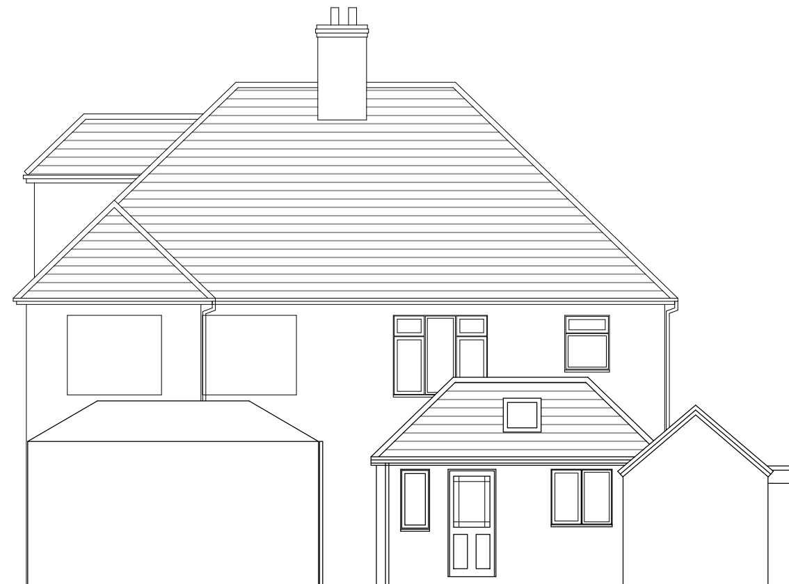
EXISTING NORTH EAST ELEVATION @ 1:100

NOTES: ALL DIMENSIONS TO BE CHECKED ON SITE AND VERIFIED PRIOR TO COMMENCING WORKS/MANUFACTURE. ANY DISCREPANCIES TO BE REPORTED TO NOUVEAU ARCHITECTURE