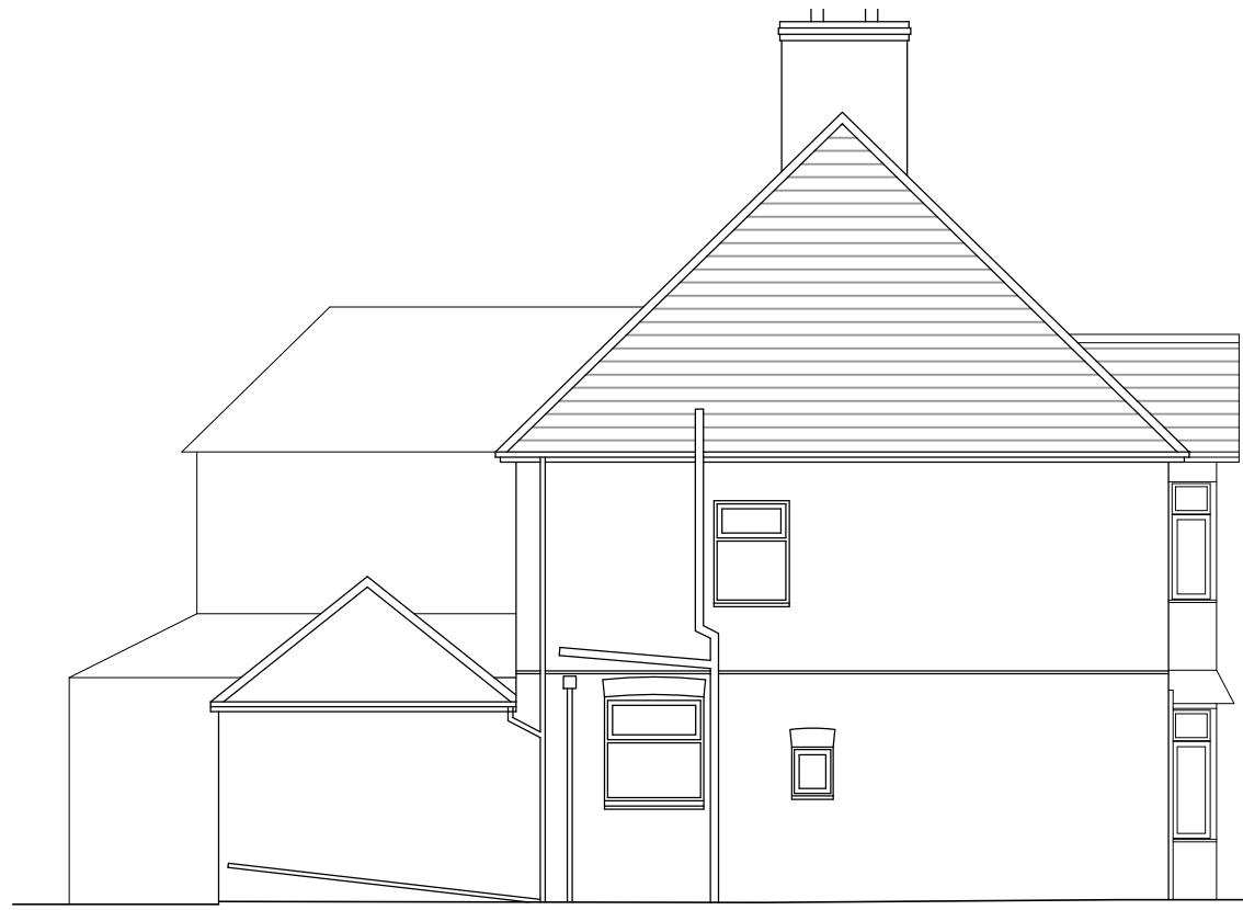
EXISTING NORTH WEST ELEVATION @ 1:100