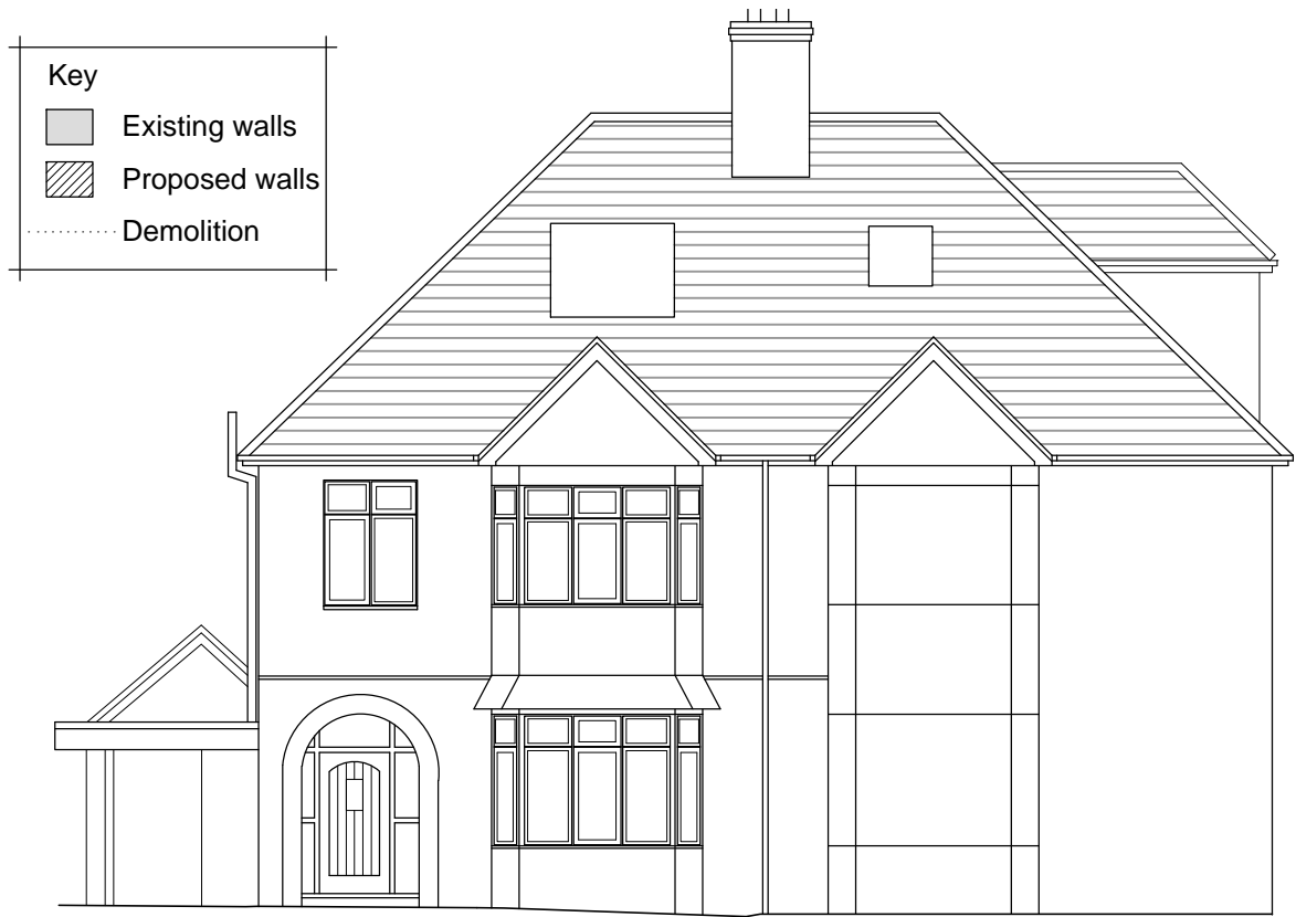
EXISTING SOUTH WEST ELEVATION @ 1:100