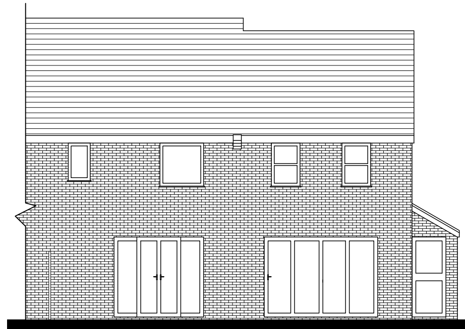
Rear Elevation Scale 1:100