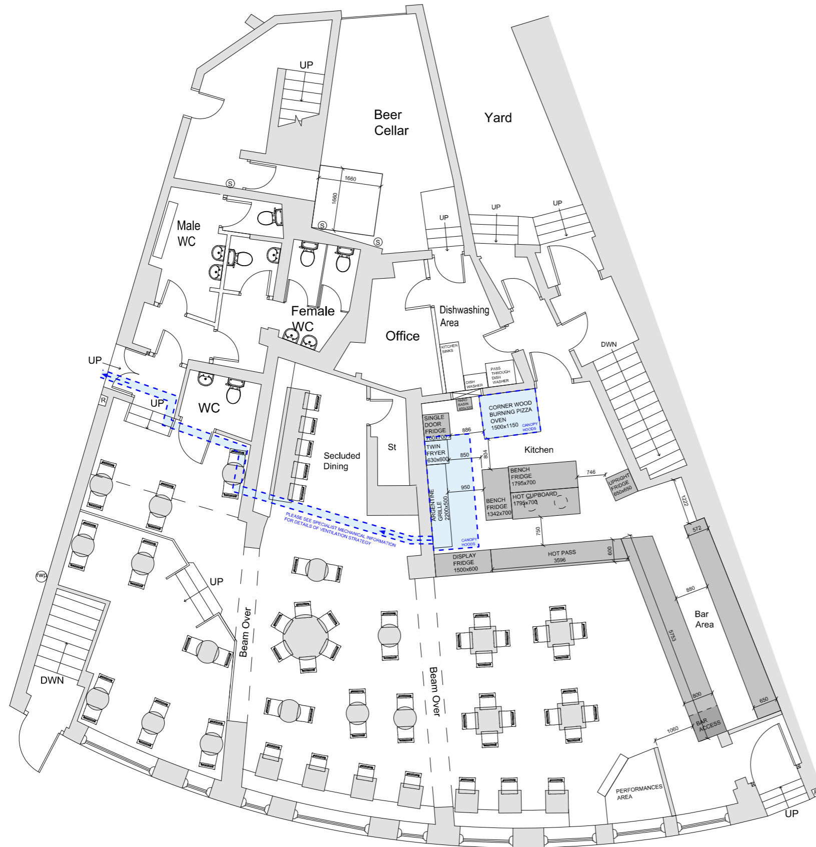
Ground Floor Plan - Mechanical/ventilation Layout