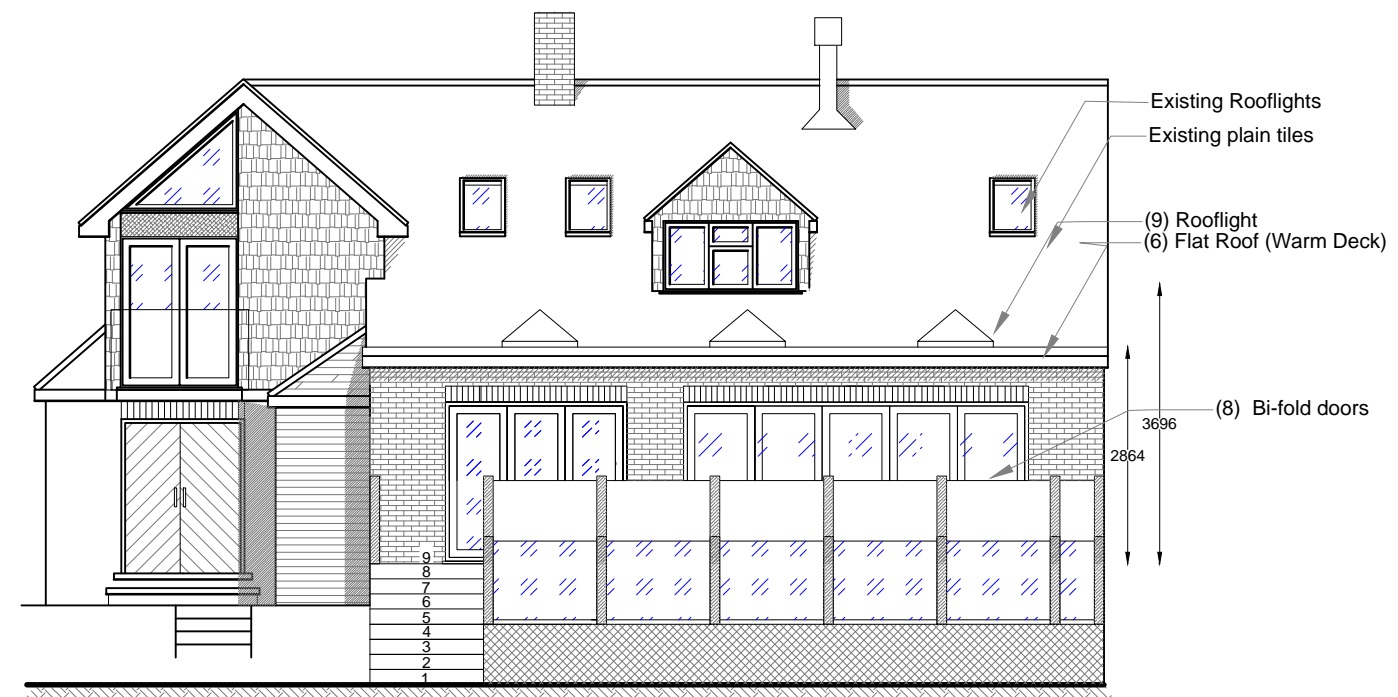
SOUTH WEST (REAR) ELEVATION