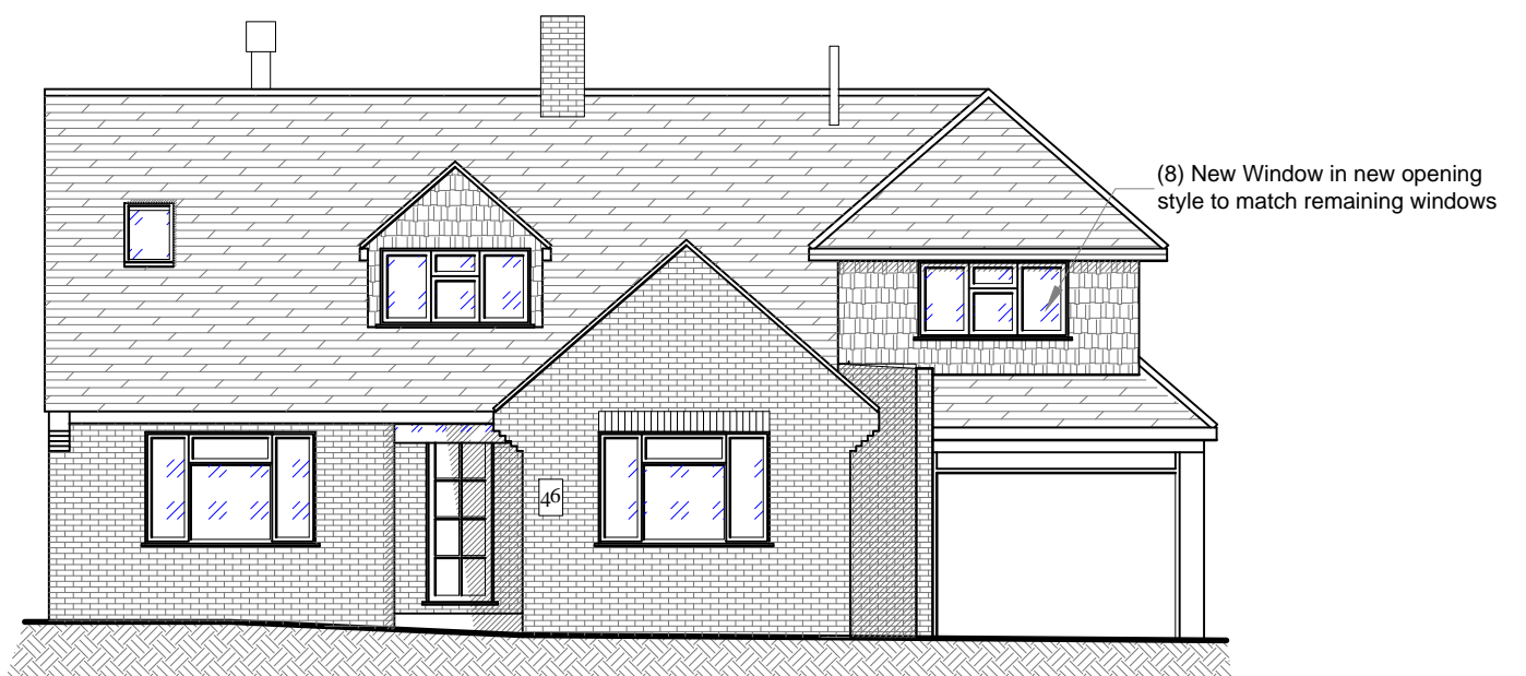
NORTH EAST (FRONT) ELEVATION

ALL NUMBERED ITEMS IN BRACKETS, eg SHOWN THUS (1) REFER TO NUMBERED SPECIFICATON LIST FOR FURTHER DETAILS