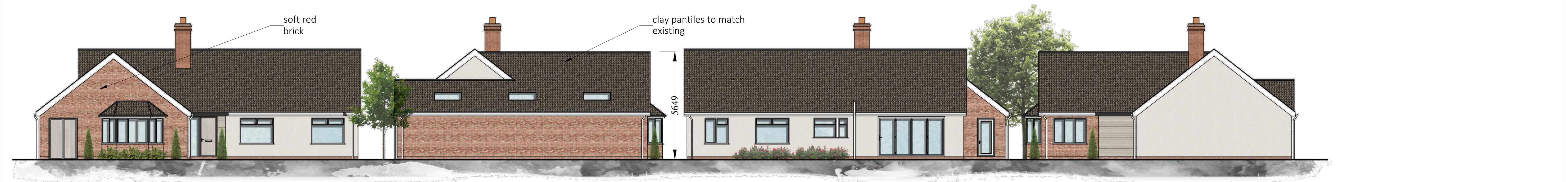
Proposed Front Elevation 1:100 @ A1