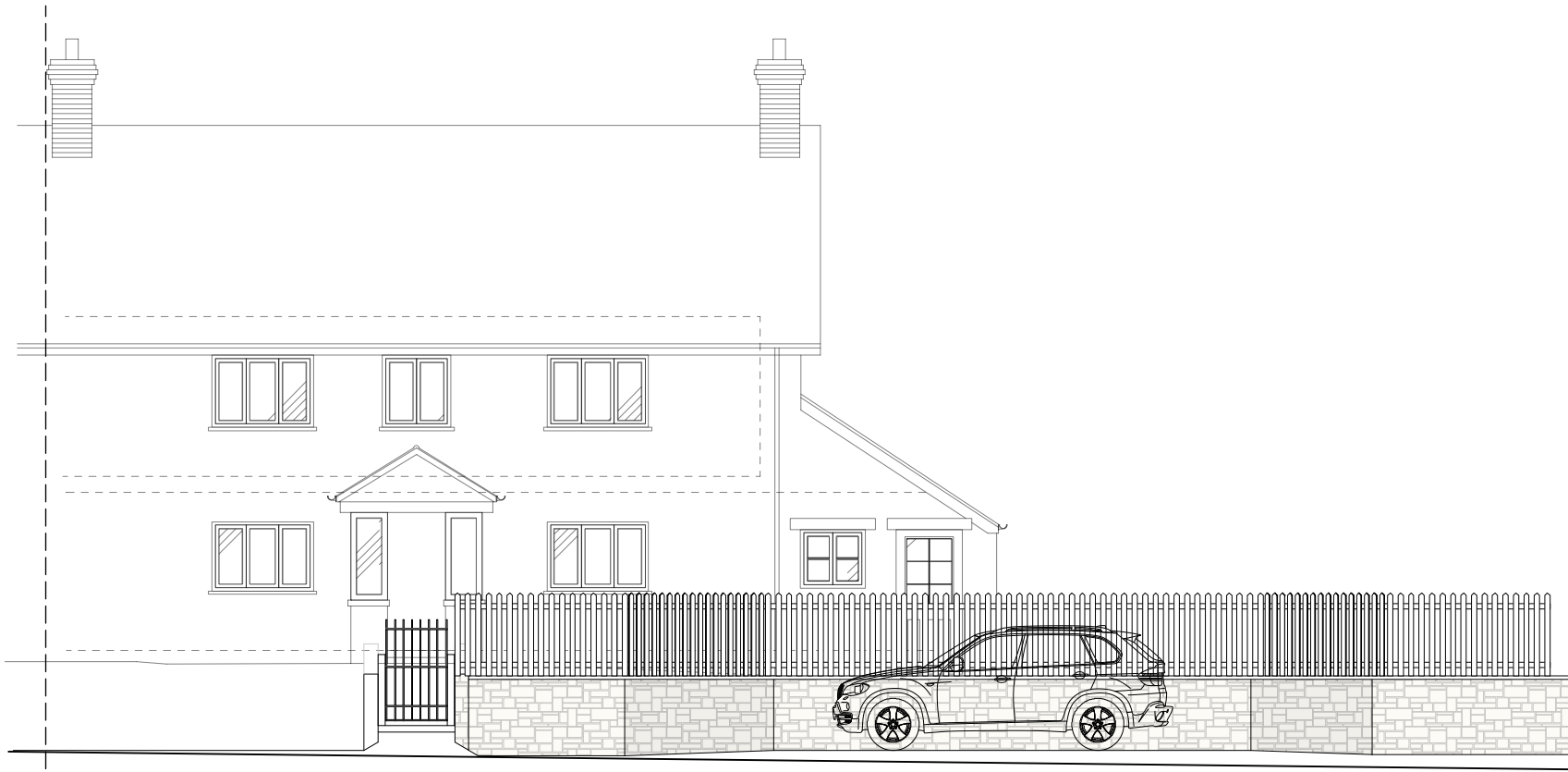
South Elevation as existing 1:100