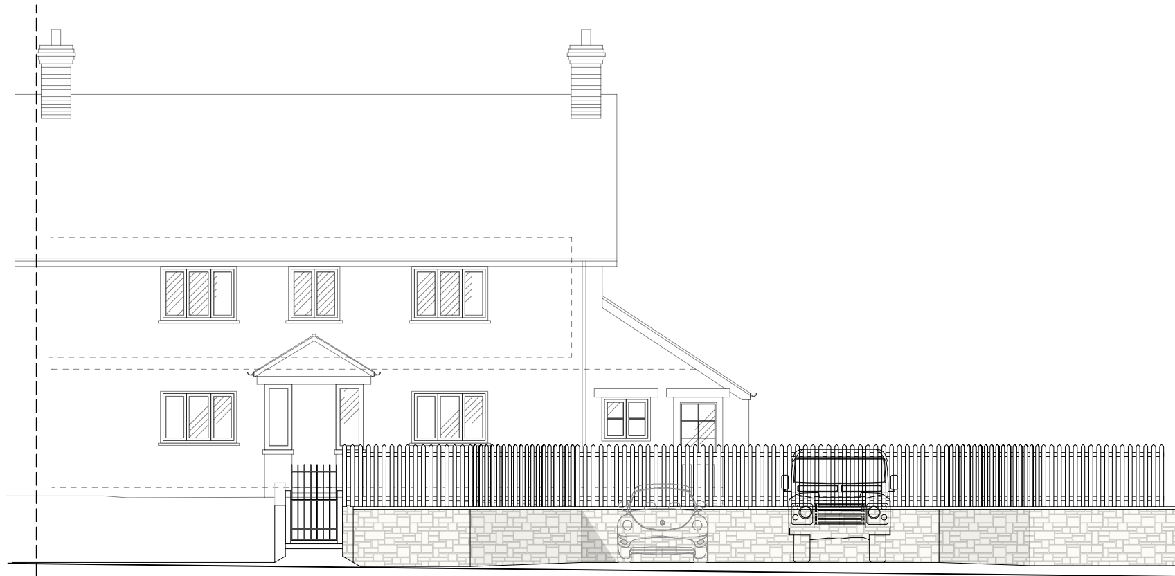
South Elevation as proposed 1:100