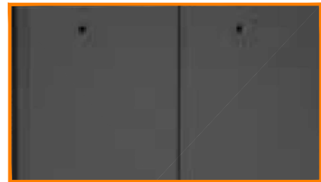
PLANUM DUO - ONYX BLACK (402)