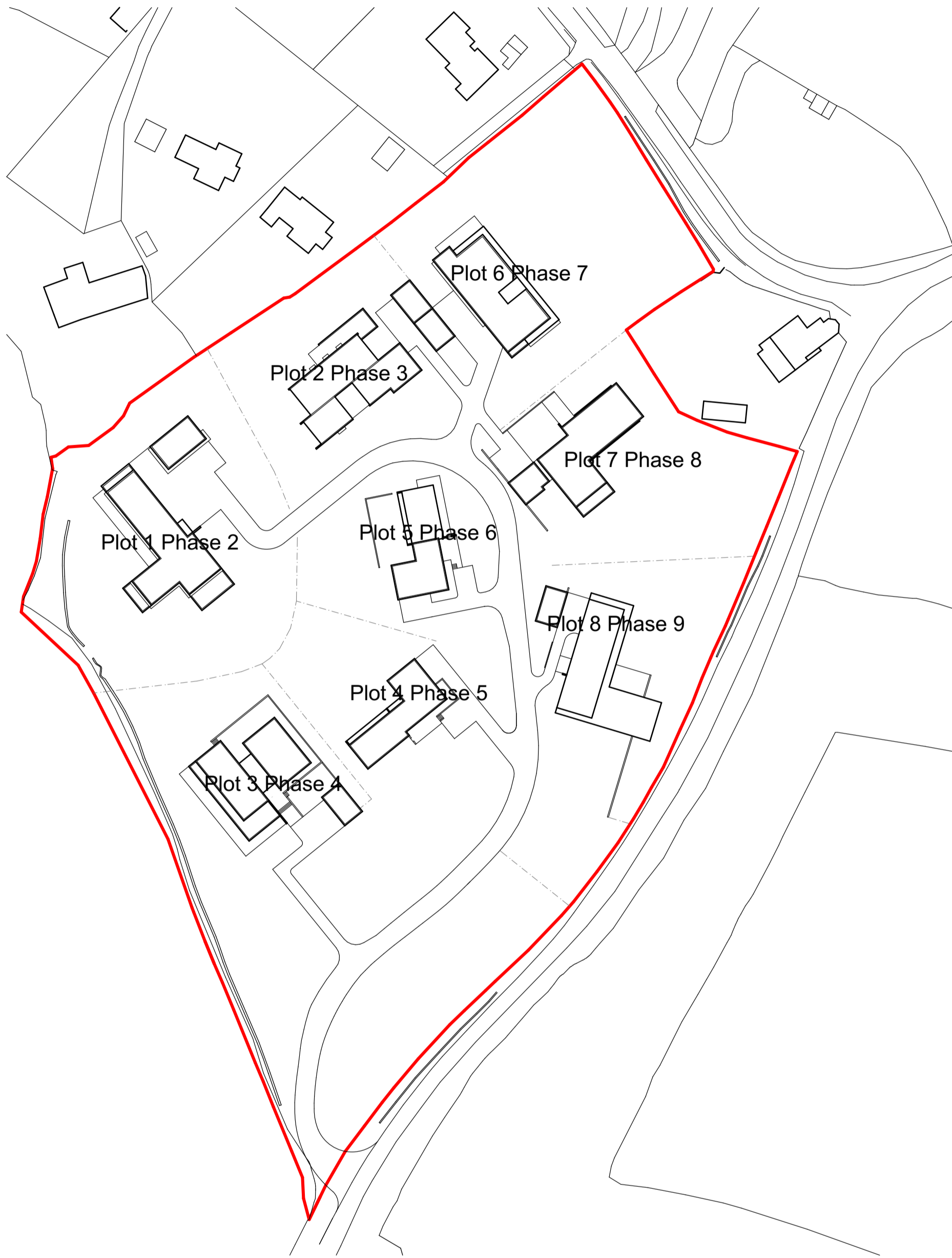
Block Plan As Previously Approved ref 18/02581/FUL