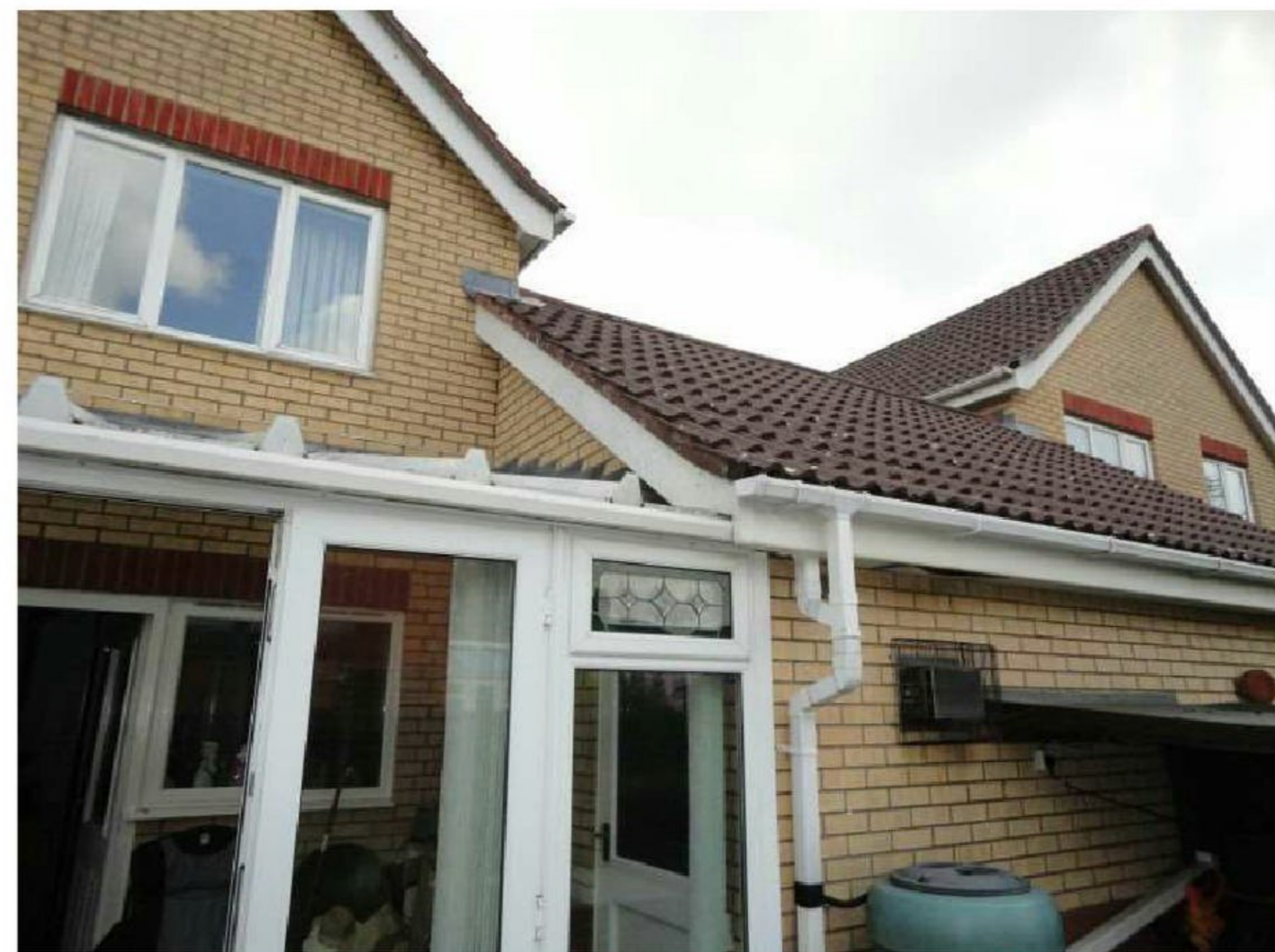
Rear Elevation 2