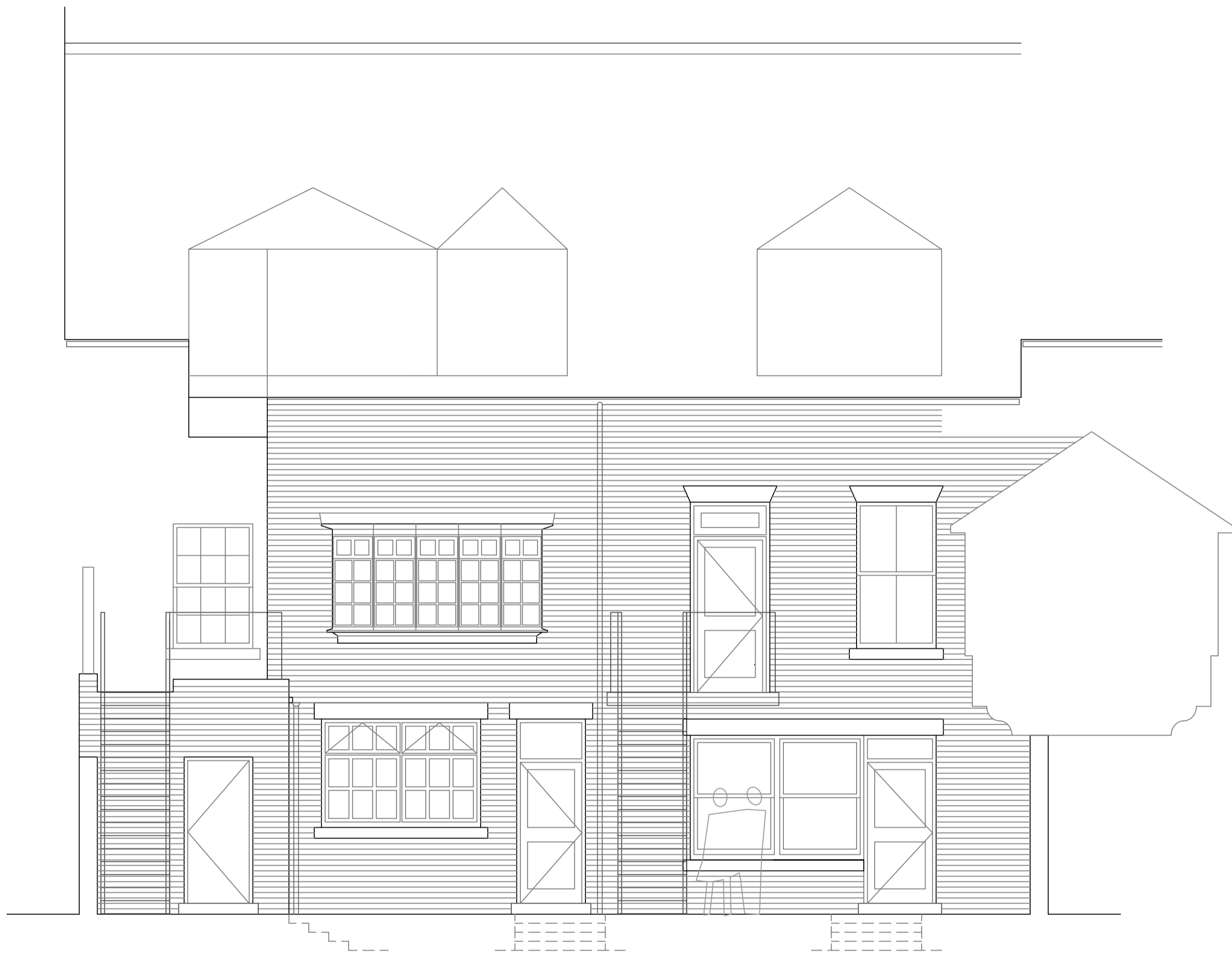
REAR ELEVATION (SOUTH) | AS EXISTING

ALL STRIPPING OUT AND DEMOLITION WORKS ARE SUBJECT TO STRUCTURAL INVESTIGATIONS.