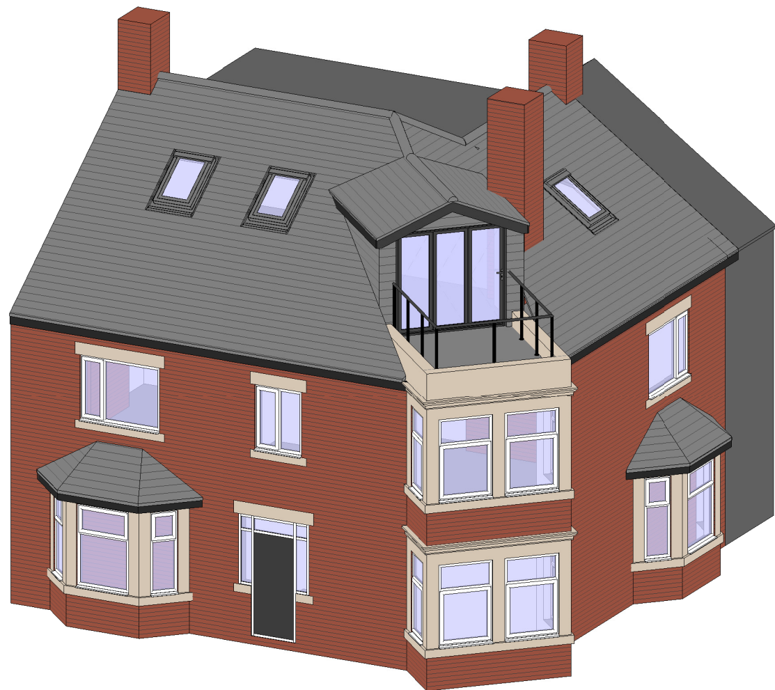
1 Front View