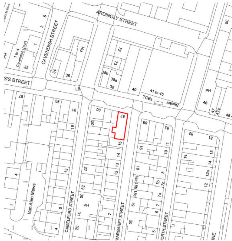
LOCATION PLAN 1:1250 @ A3