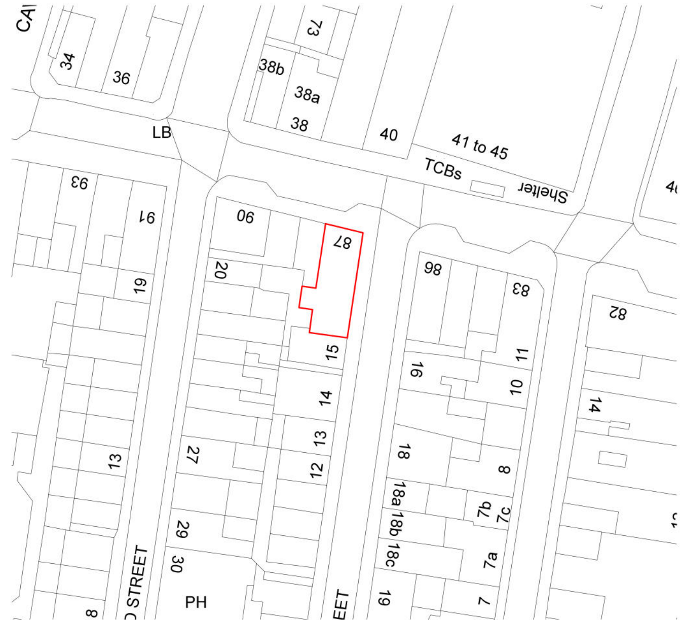
BLOCK PLAN 1:500 @ A3

GENERAL NOTES: USE FIGURED DIMENSIONS ONLY DO NOT SCALE OFF DRAWINGS ALL DIMENSIONS ARE TO BE CHECKED ON SITE INCONSISTENCIES ARE TO BE REPORTED IMMEDIATELY