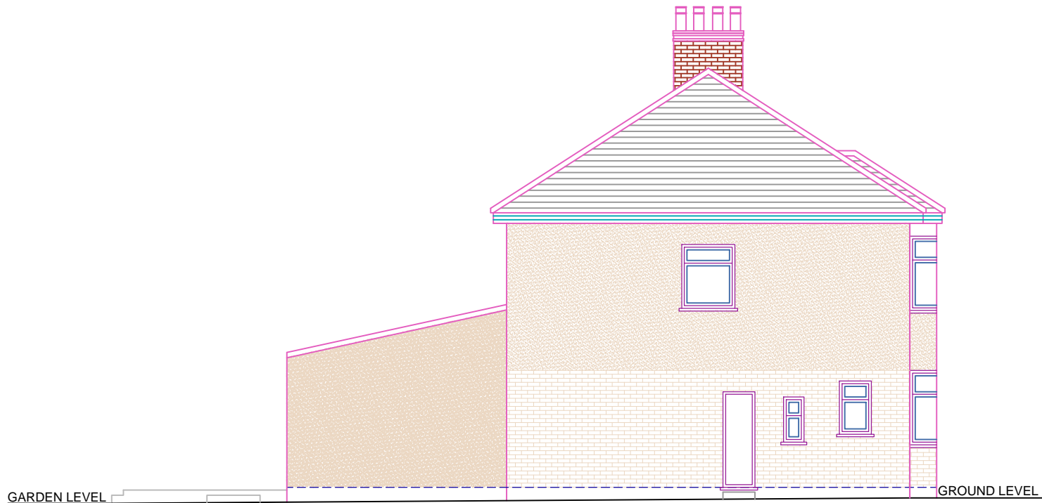
EXISTING ELEVATION SIDE A