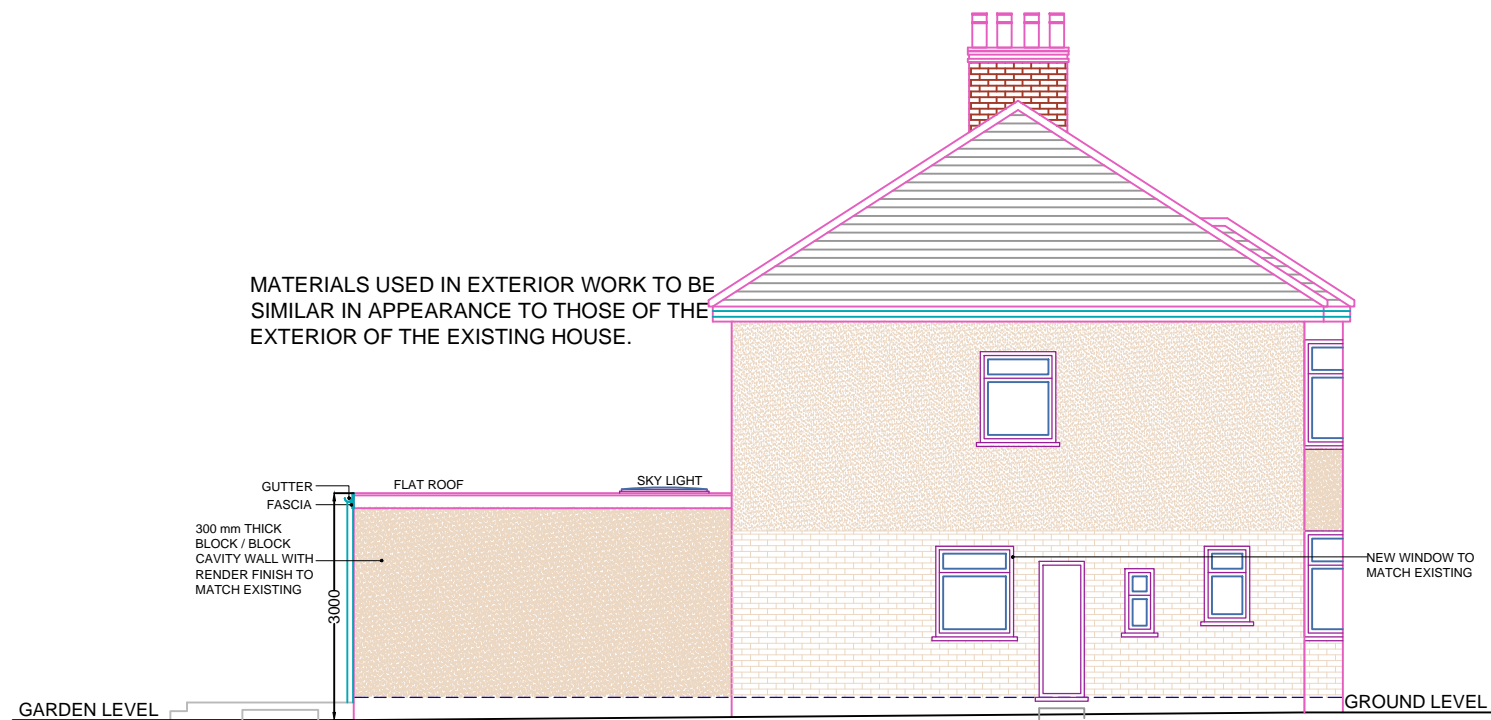
PROPOSED ELEVATION SIDE A