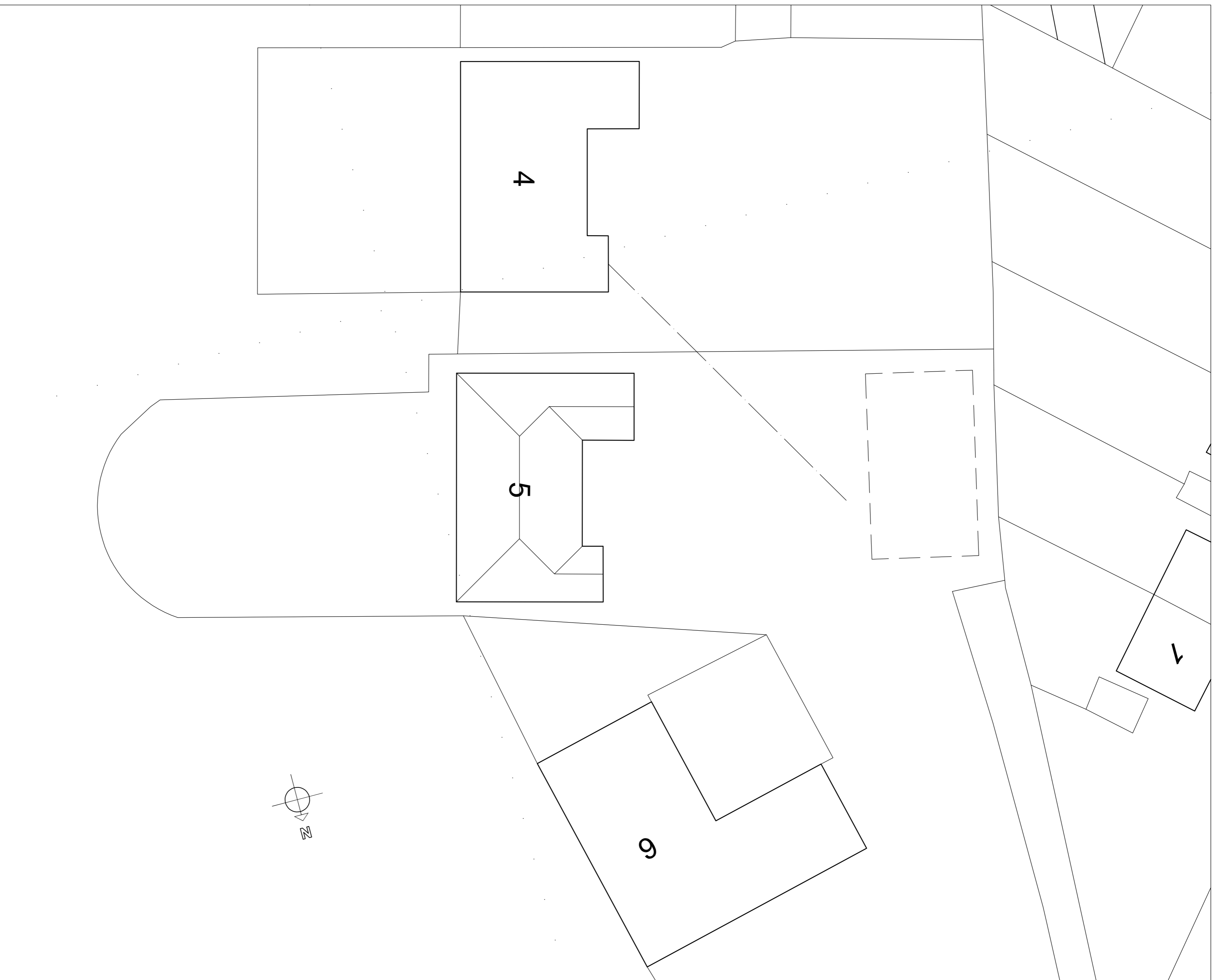
SITE LAYOUT PLAN AS EXISTING